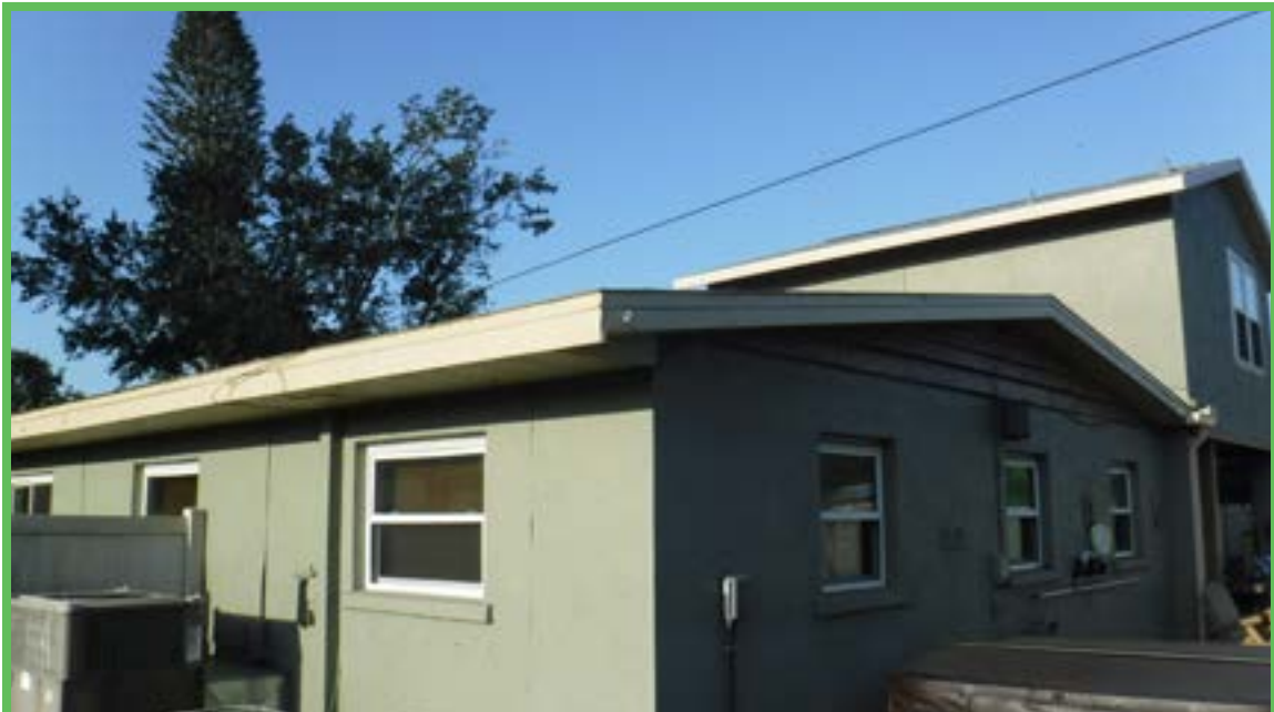
Rear and Right Elevation