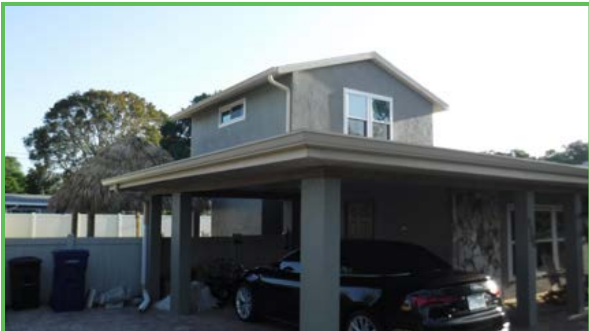
Front and Left Elevation