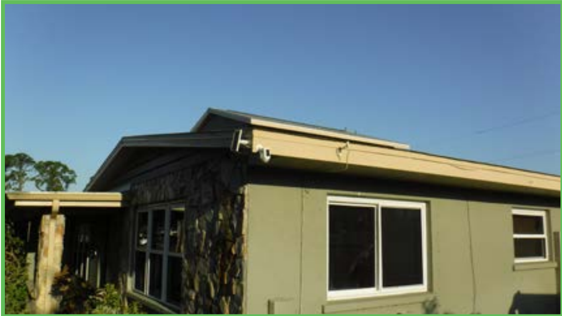
Front and Right Elevation