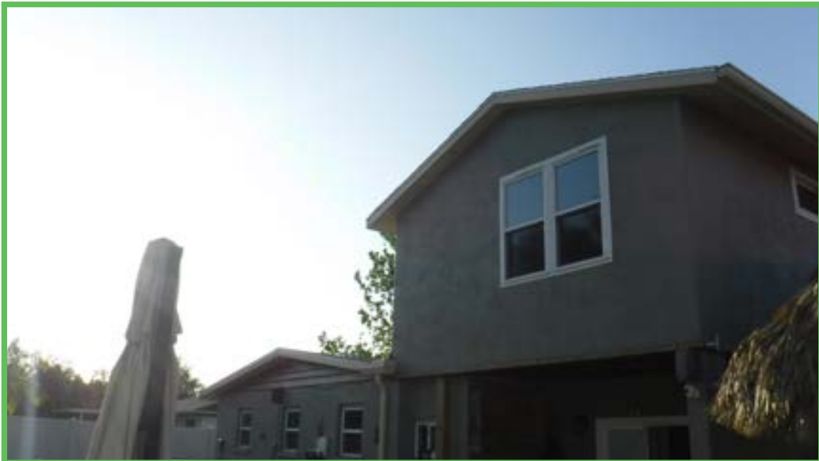
Rear and Left Elevation