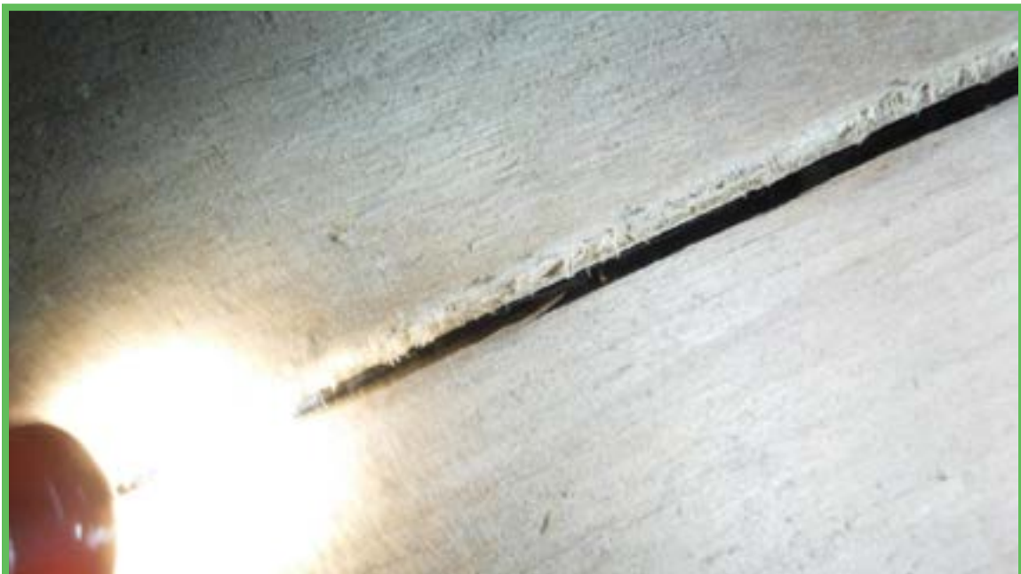
Secondary Water Resistance (SWR)