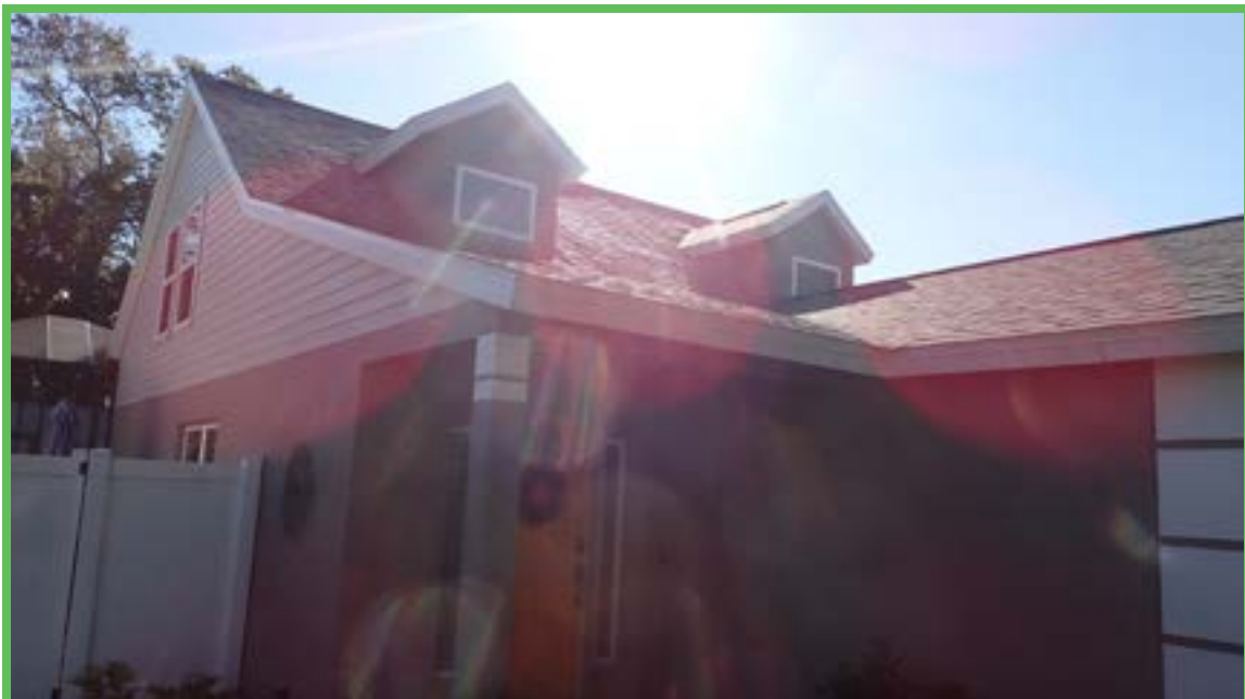
Front and Left Elevation