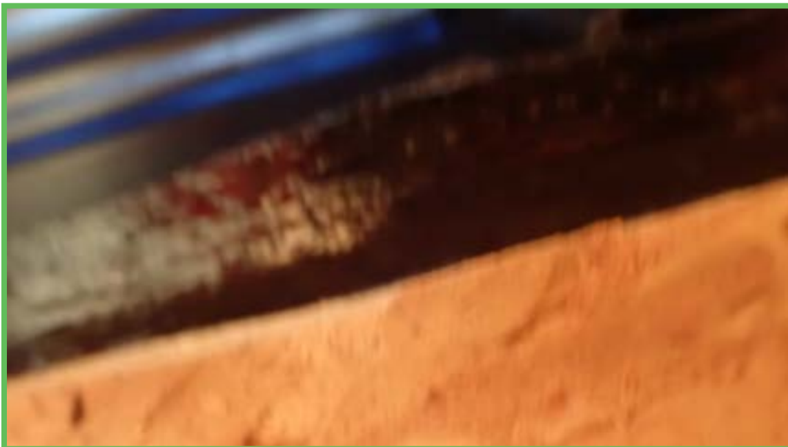
Secondary Water Resistance (SWR)