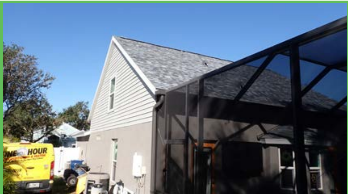
Rear and Right Elevation