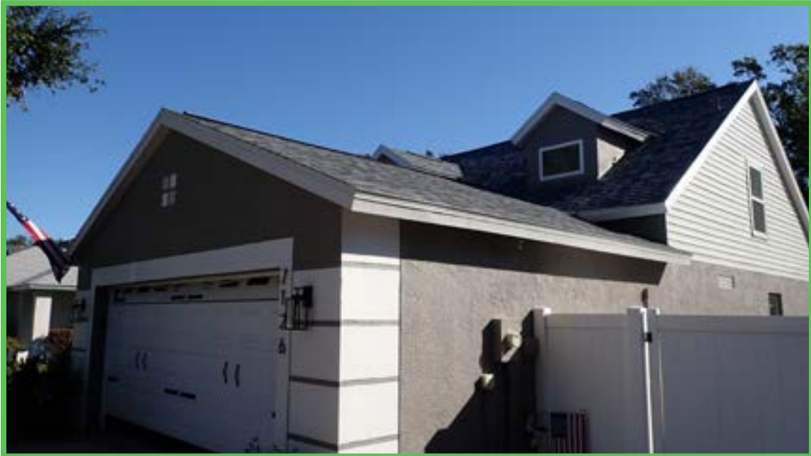
Front and Right Elevation