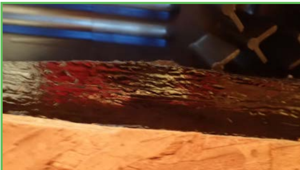
Secondary Water Resistance (SWR)