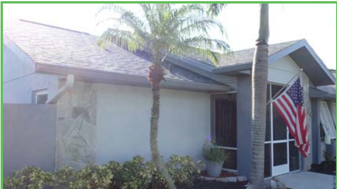
Front and Left Elevation