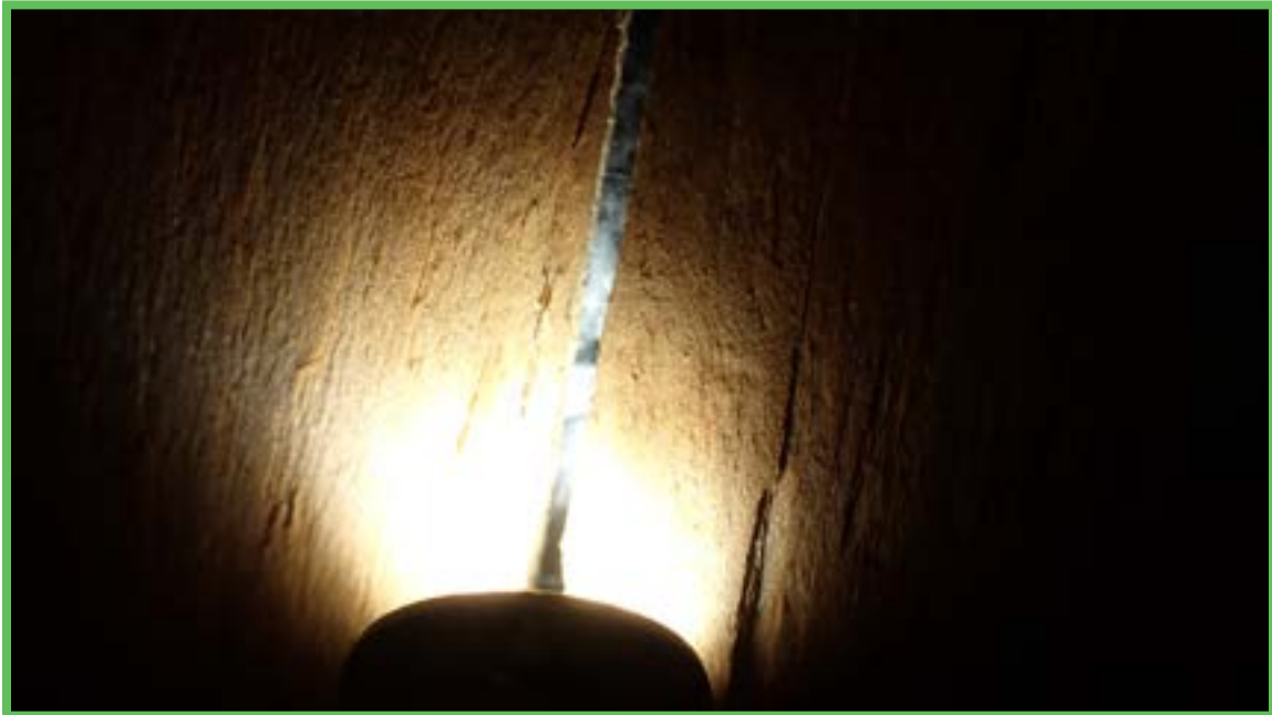
Secondary Water Resistance (SWR)