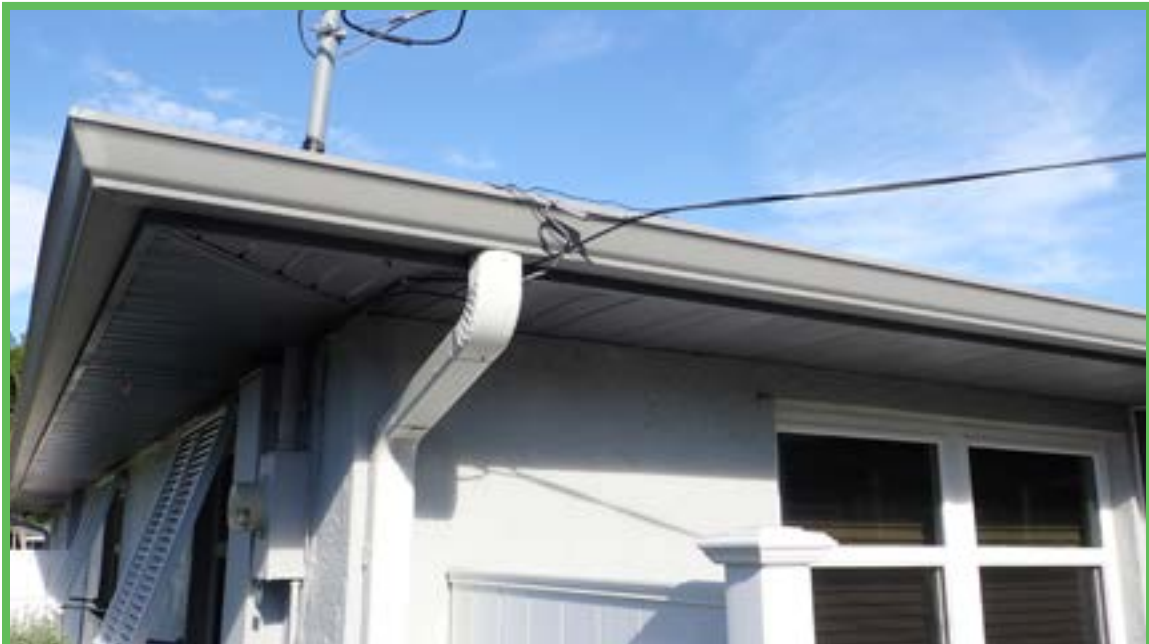
Rear and Right Elevation