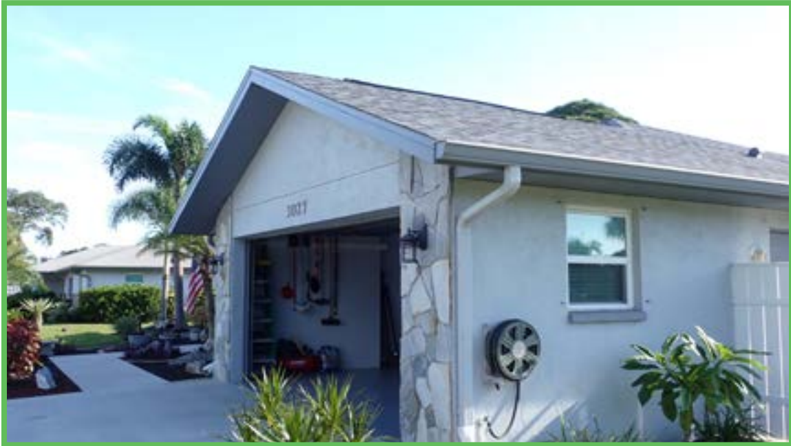
Front and Right Elevation