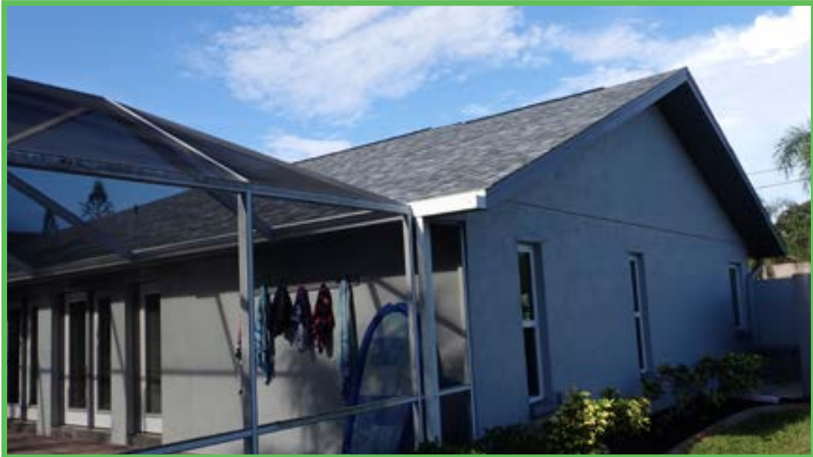
Rear and Left Elevation