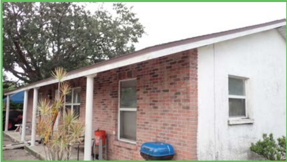
Front and Right Elevation