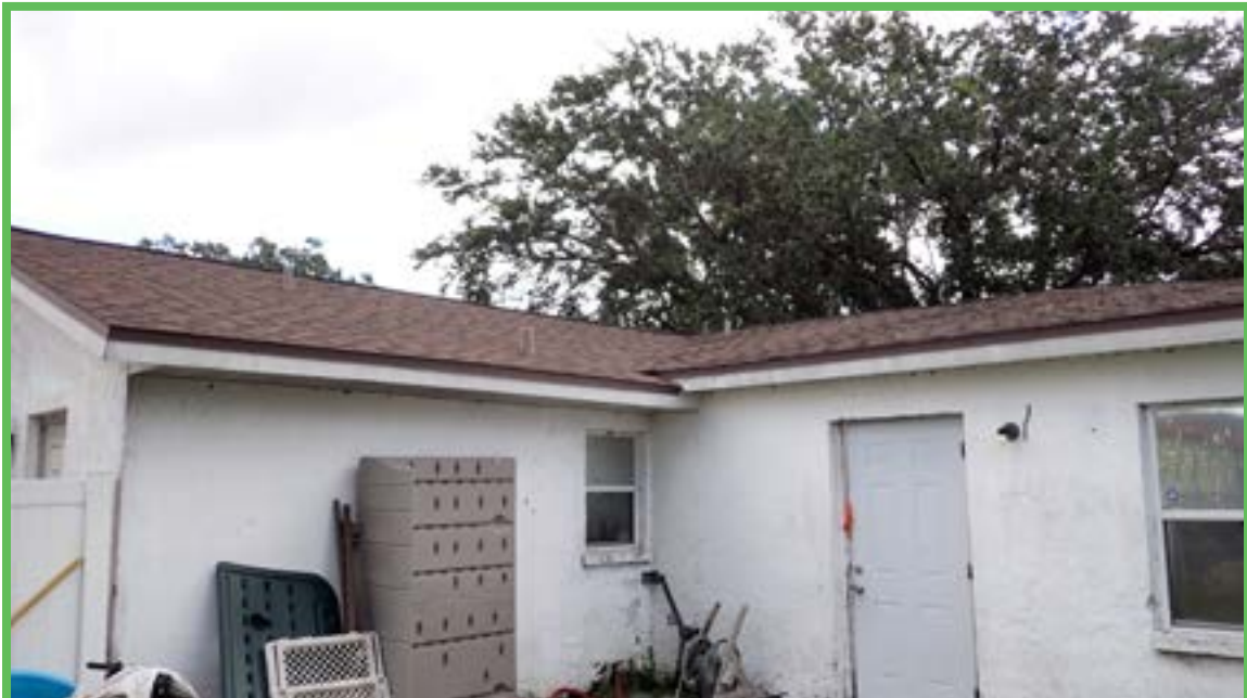
Rear and Right Elevation