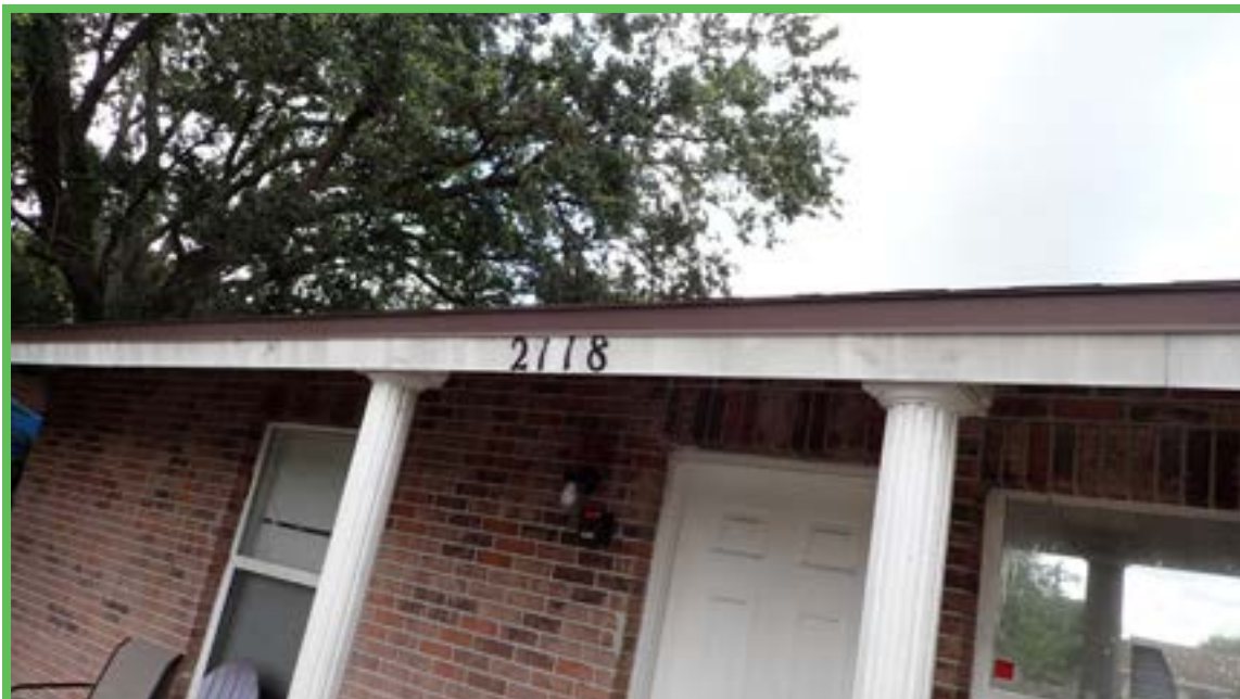
Front and Left Elevation