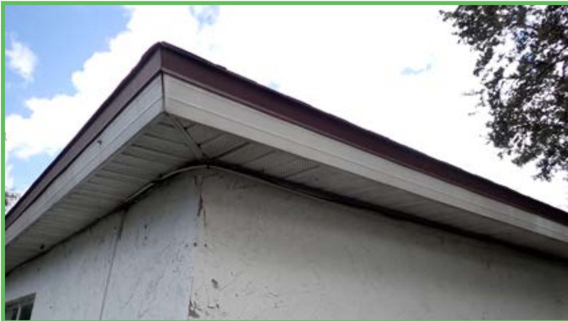
Rear and Left Elevation