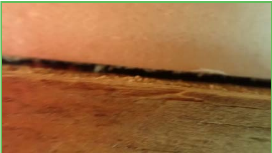
Secondary Water Resistance (SWR)