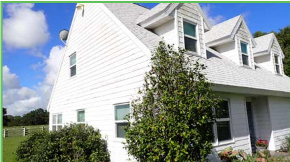
Front and Left Elevation