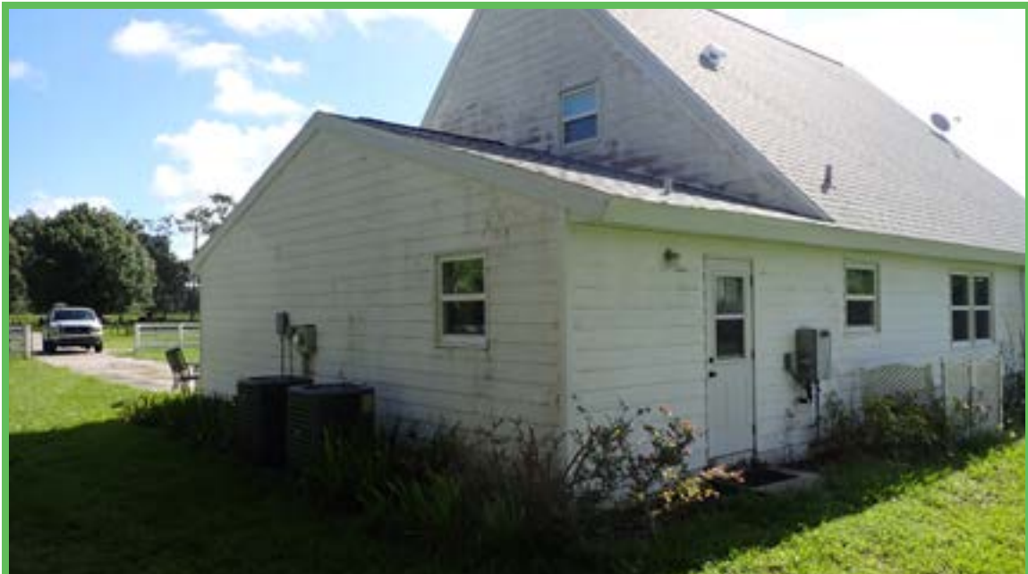
Rear and Right Elevation