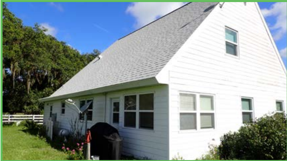
Rear and Left Elevation