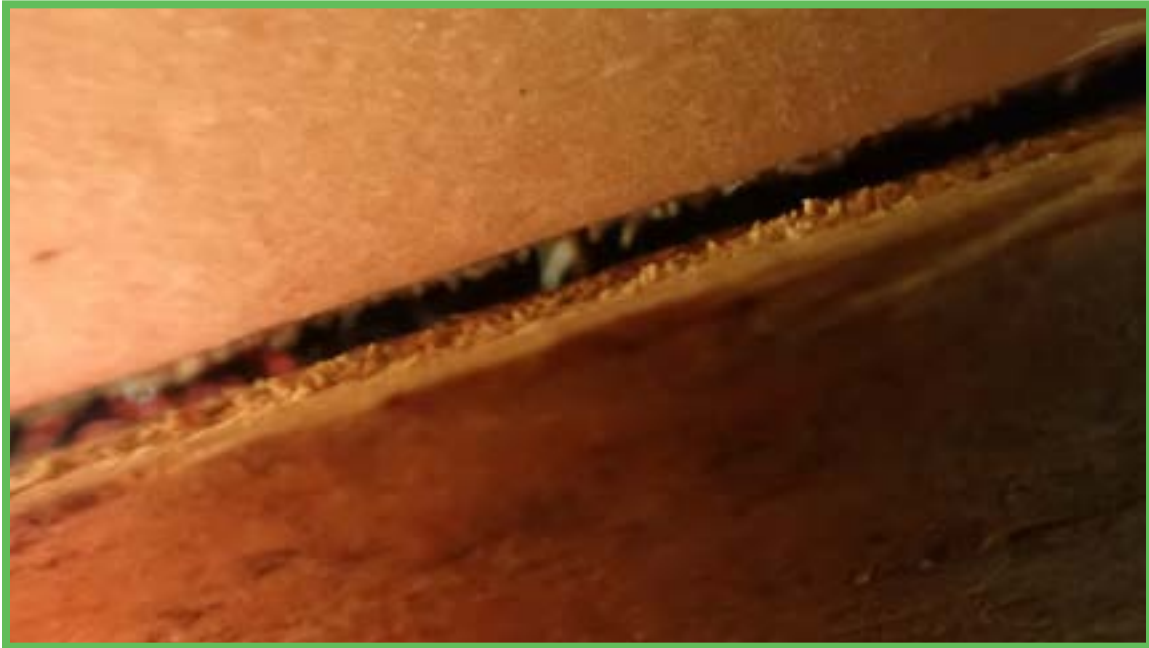
Secondary Water Resistance (SWR)