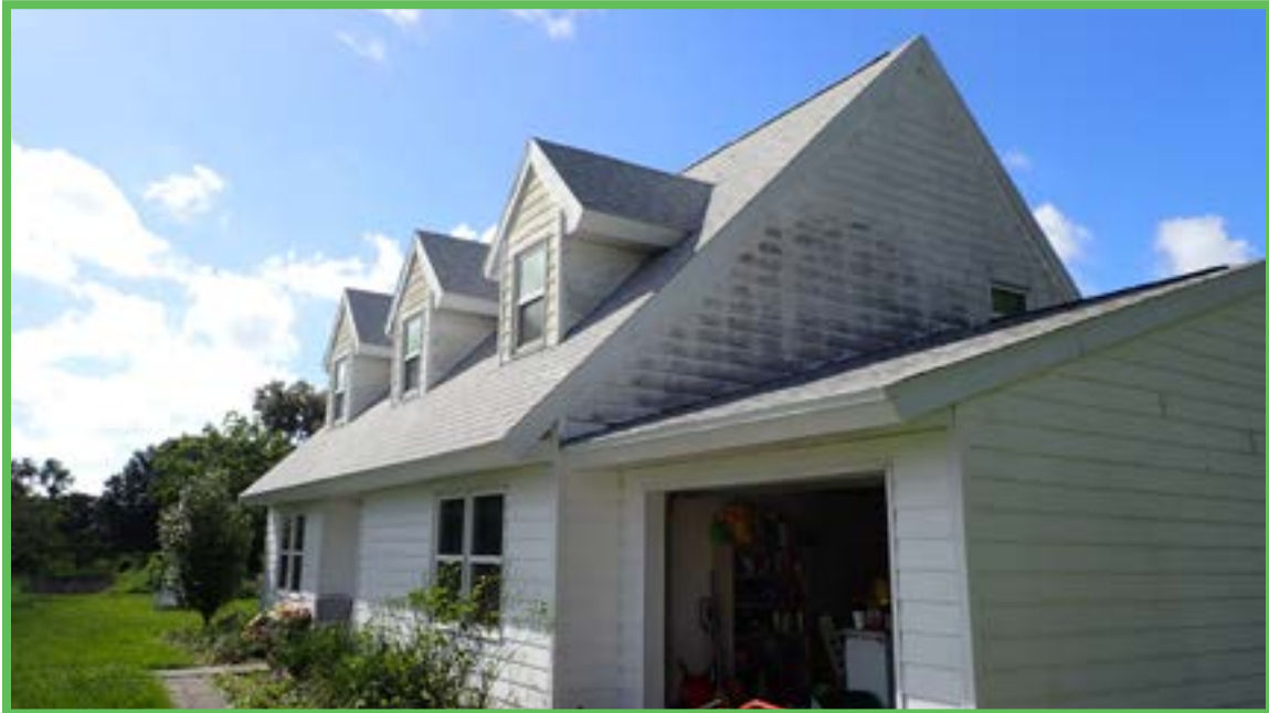
Front and Right Elevation