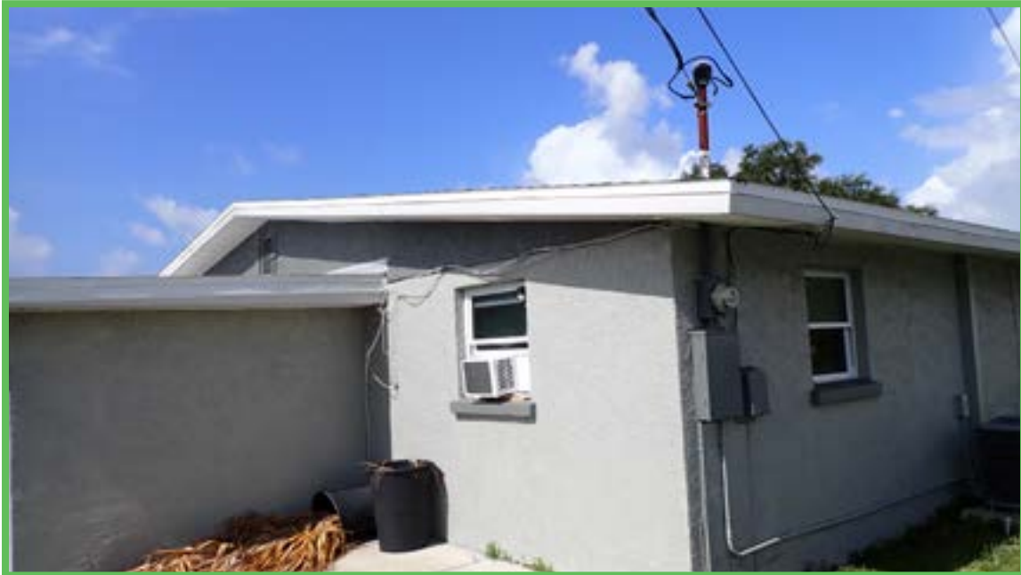
Rear and Left Elevation