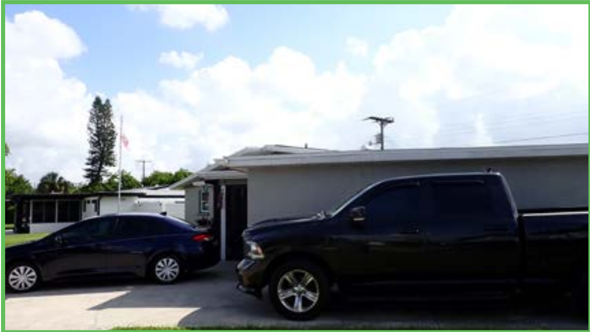
Front and Right Elevation