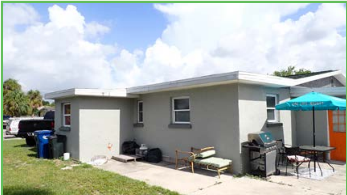
Rear and Right Elevation