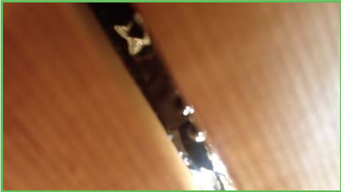
Secondary Water Resistance (SWR)