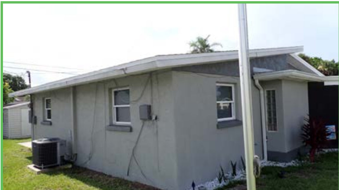
Front and Left Elevation