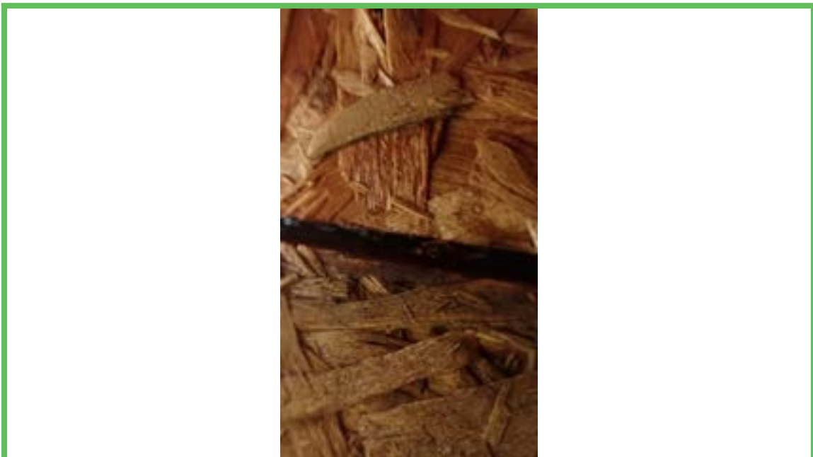
Secondary Water Resistance (SWR)