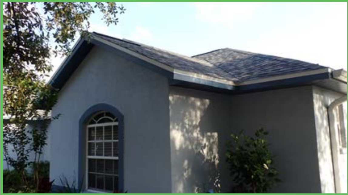
Front and Right Elevation