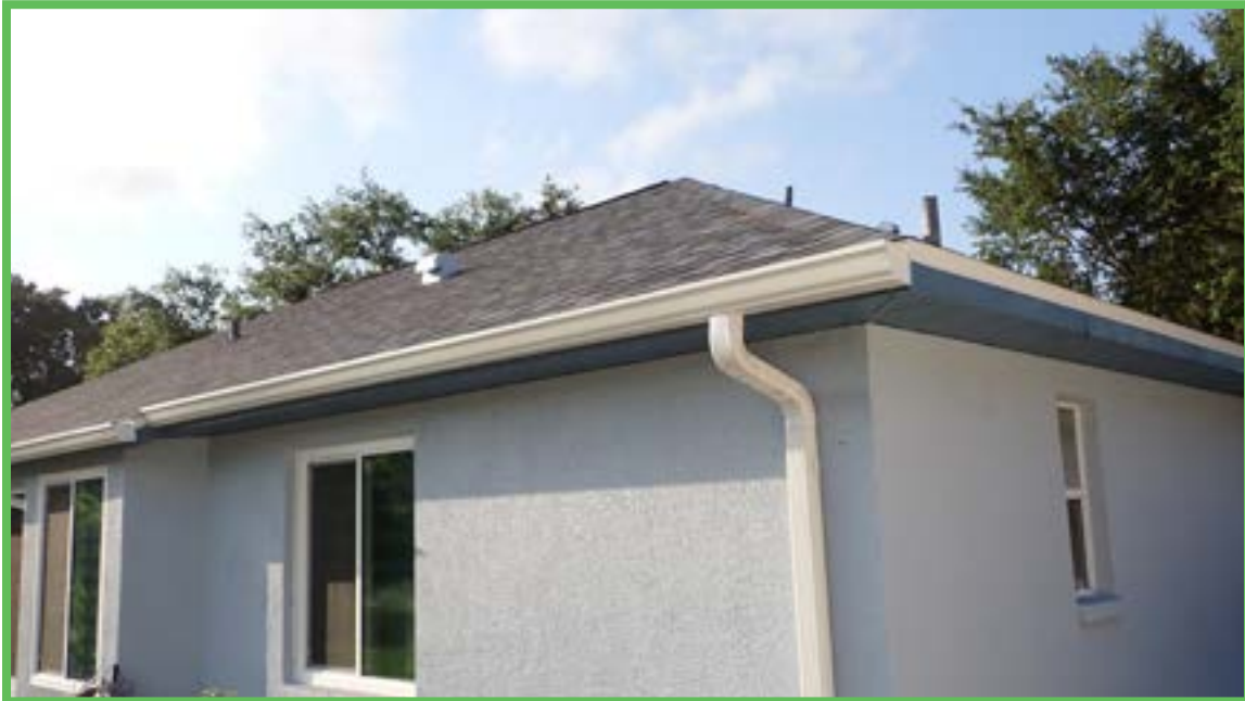
Rear and Left Elevation