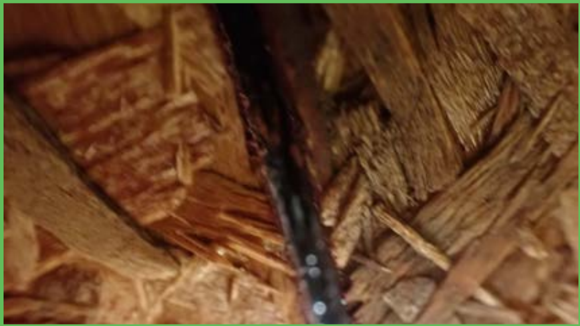
Secondary Water Resistance (SWR)