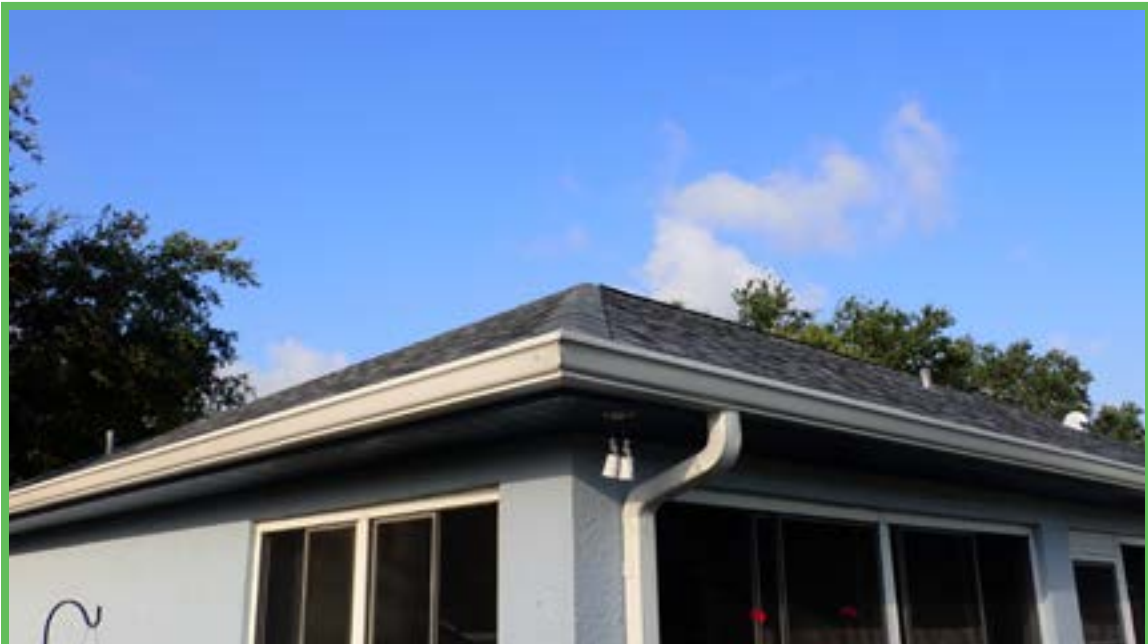
Rear and Right Elevation