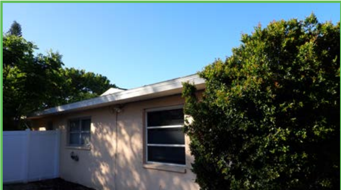
Rear and Right Elevation