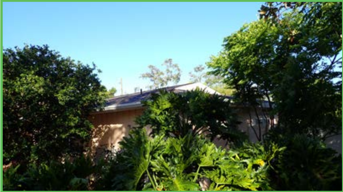
Front and Right Elevation

West Florida Inspections 2311 58th St E Palmetto Florida 34221 HI 3192