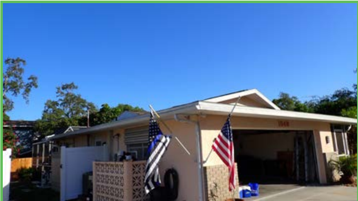
Front and Left Elevation