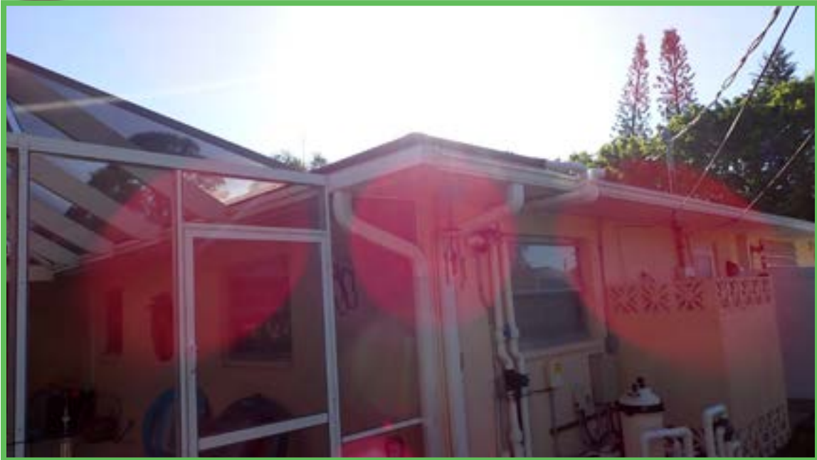
Rear and Left Elevation

West Florida Inspections 2311 58th St E Palmetto Florida 34221 HI 3192