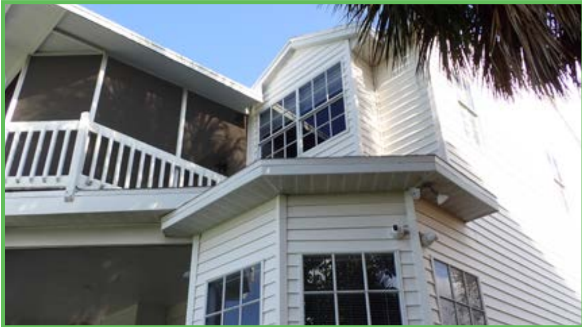
Rear and Left Elevation