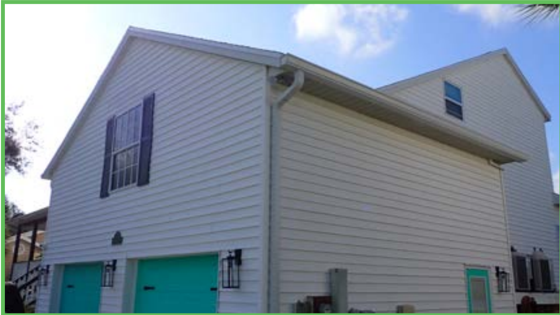
Front and Right Elevation