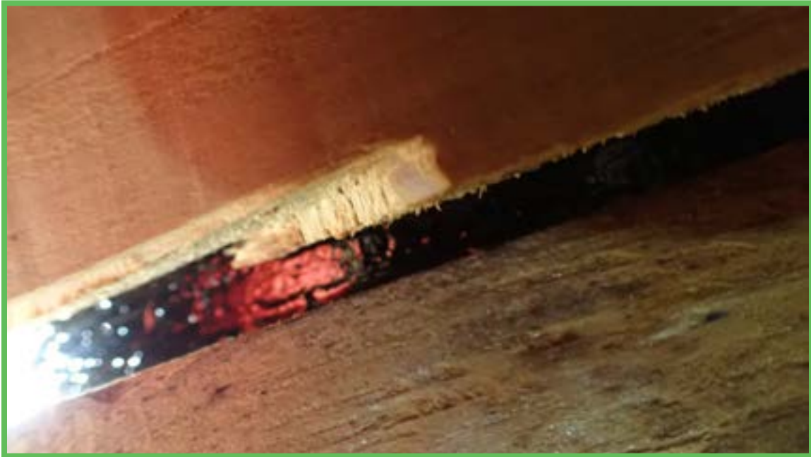
Secondary Water Resistance (SWR)