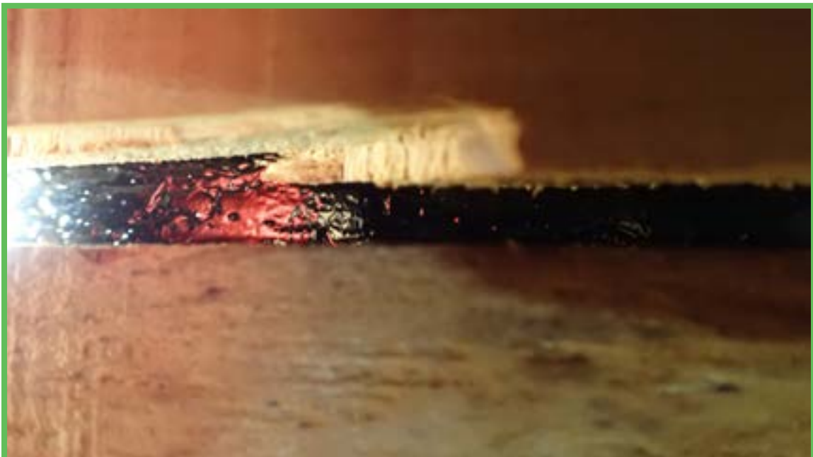
Secondary Water Resistance (SWR)