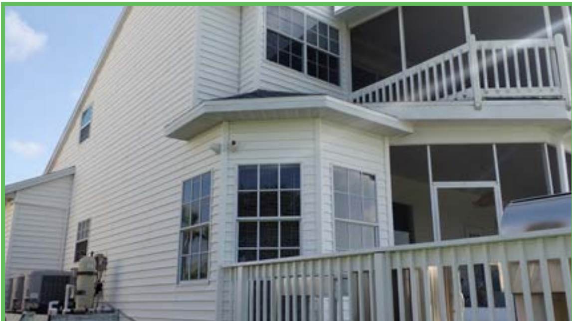
Rear and Right Elevation