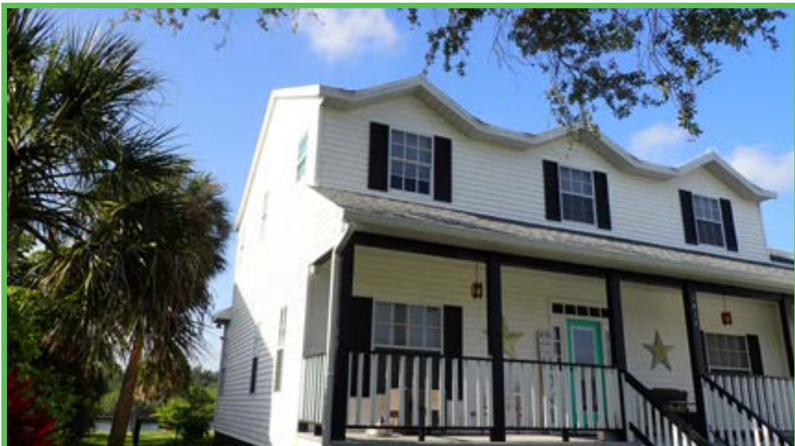
Front and Left Elevation