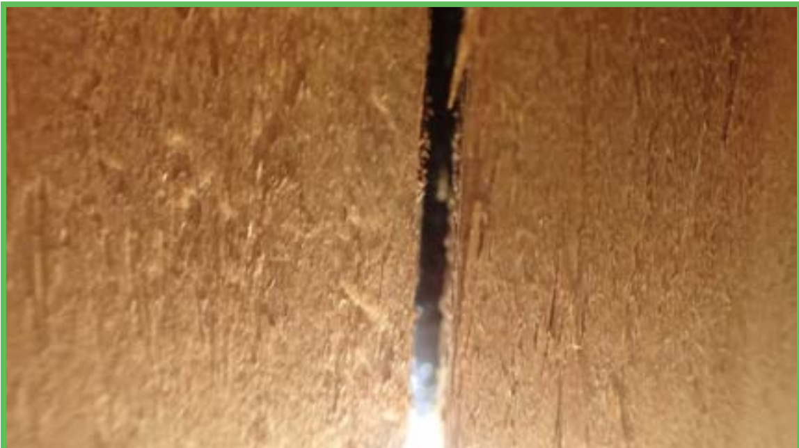
Secondary Water Resistance (SWR)