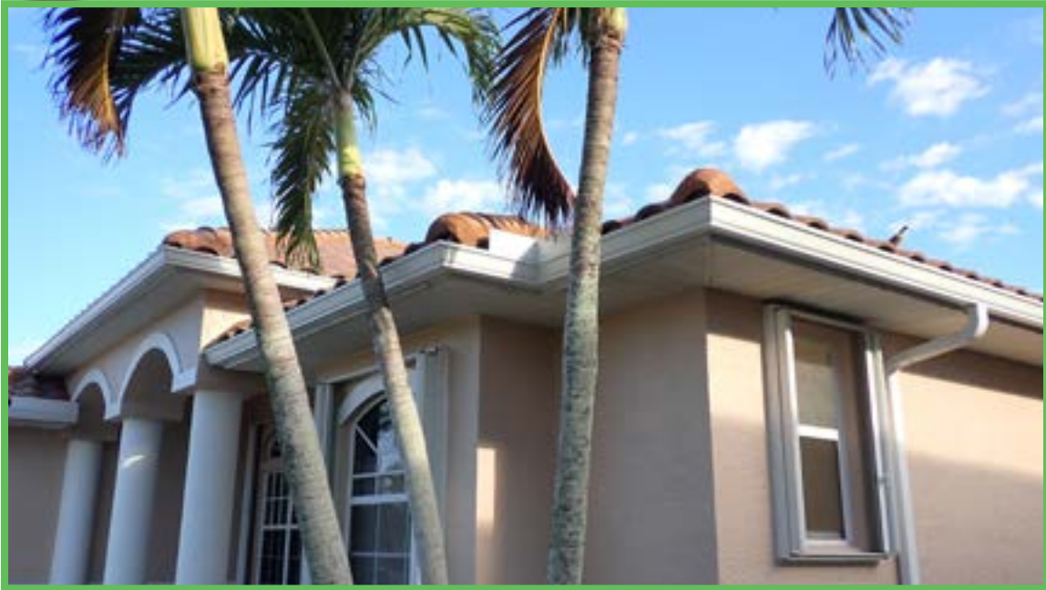
Front and Right Elevation

West Florida Inspections 2311 58th St E Palmetto Florida 34221 HI 3192