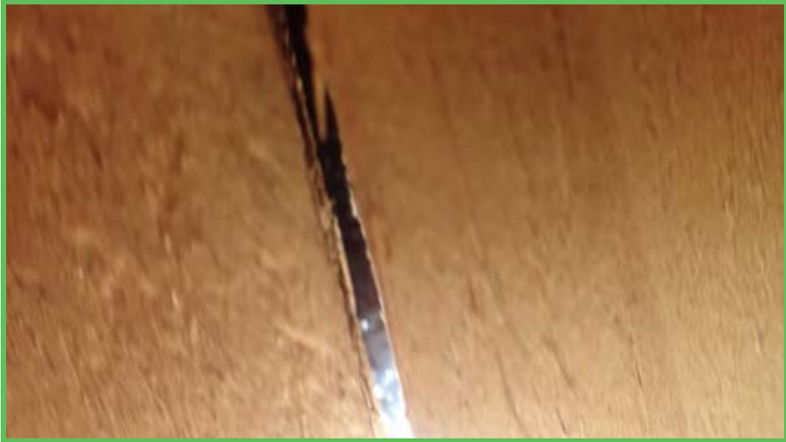
Secondary Water Resistance (SWR)

West Florida Inspections 2311 58th St E Palmetto Florida 34221 HI 3192