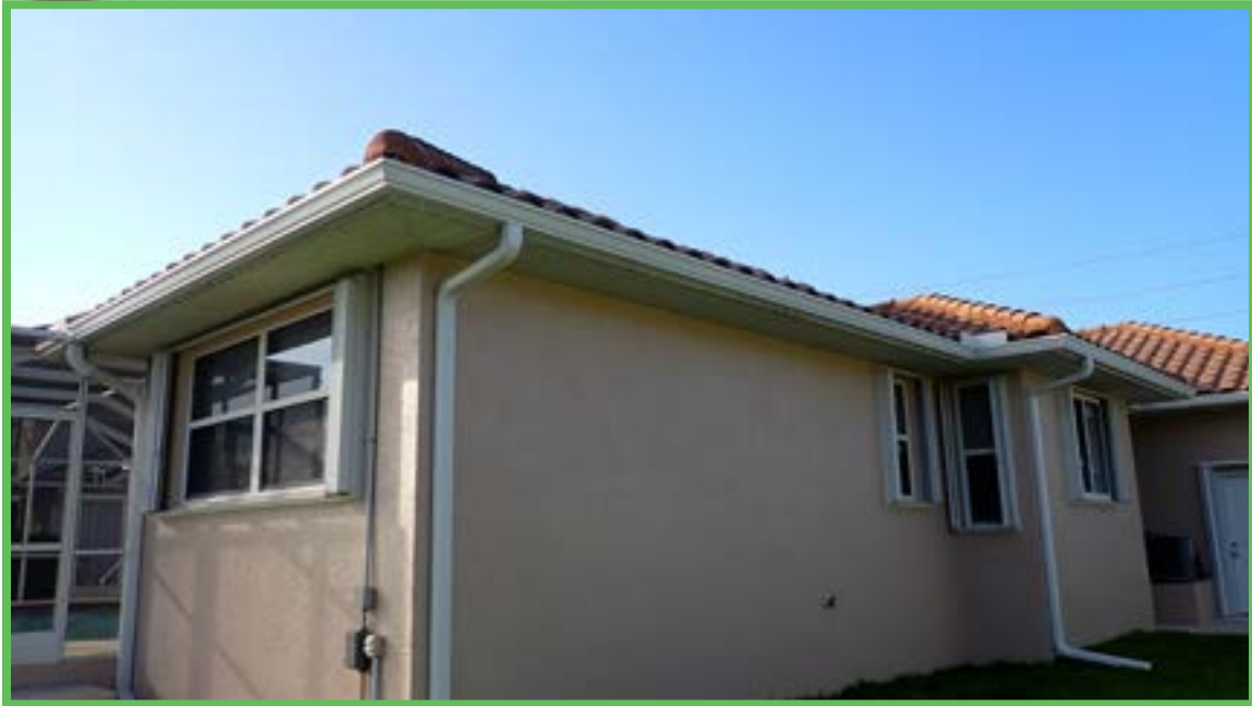
Rear and Left Elevation

West Florida Inspections 2311 58th St E Palmetto Florida 34221 HI 3192