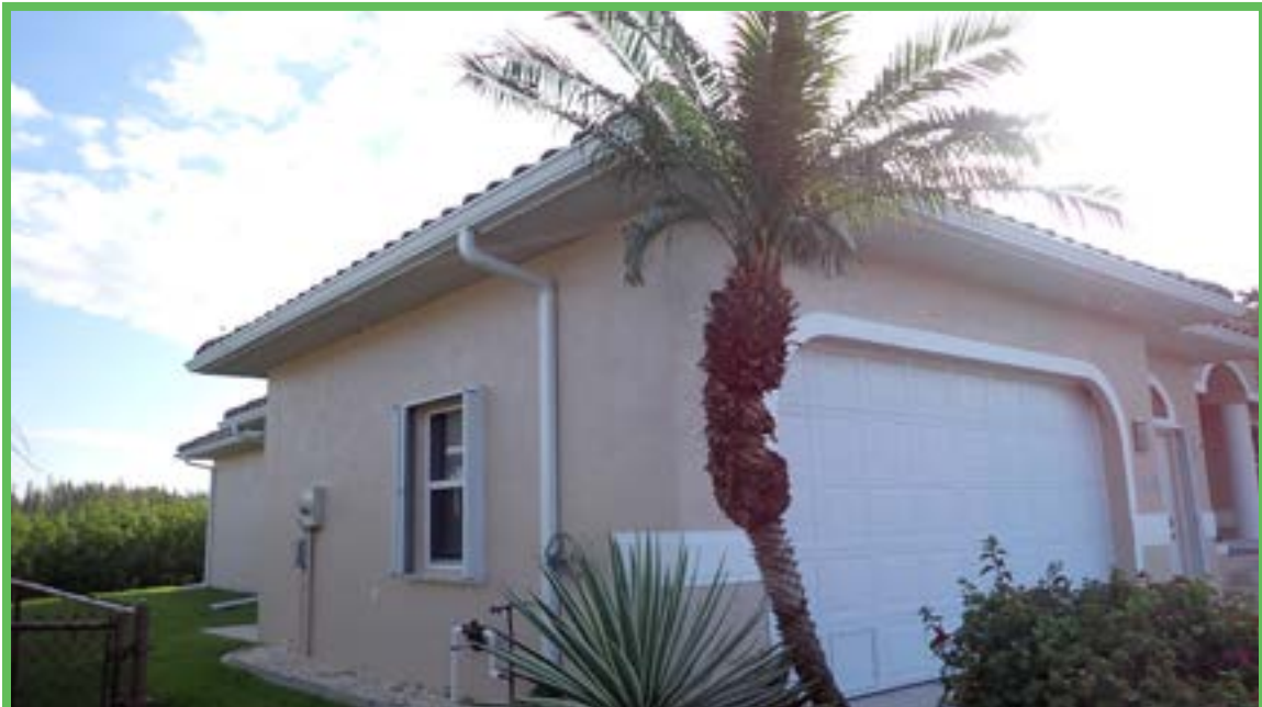
Front and Left Elevation