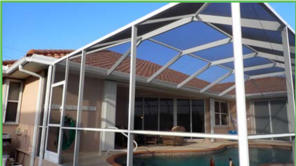
Rear and Right Elevation