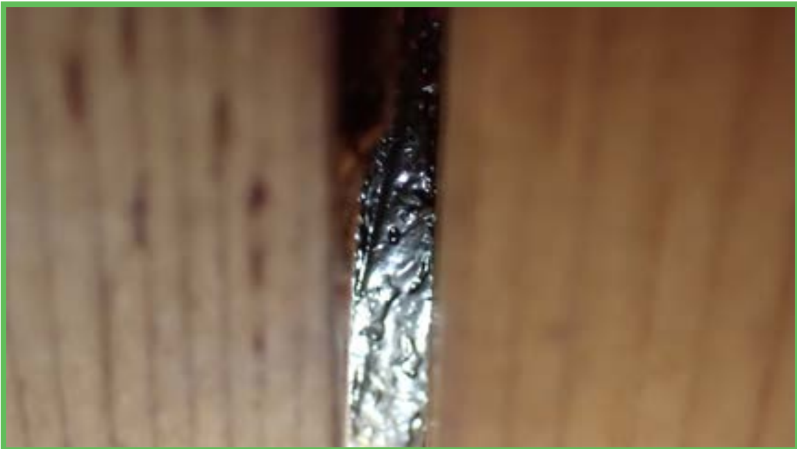
Secondary Water Resistance (SWR)