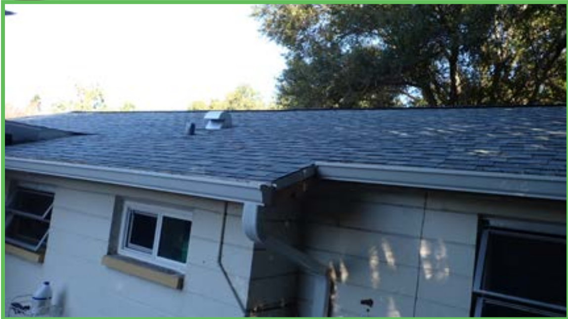
Rear and Left Elevation

West Florida Inspections 2311 58th St E Palmetto Florida 34221 HI 3192