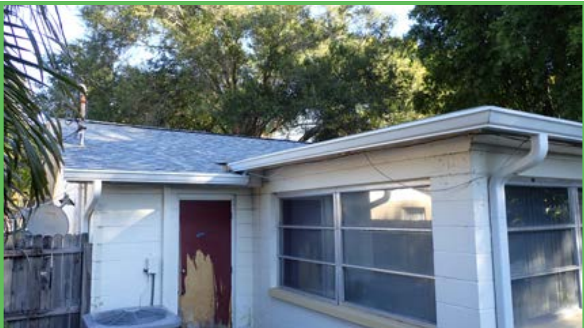
Rear and Right Elevation