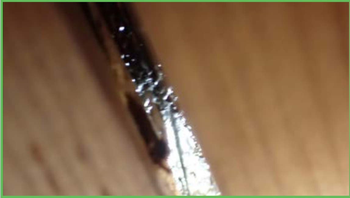
Secondary Water Resistance (SWR)

West Florida Inspections 2311 58th St E Palmetto Florida 34221 HI 3192