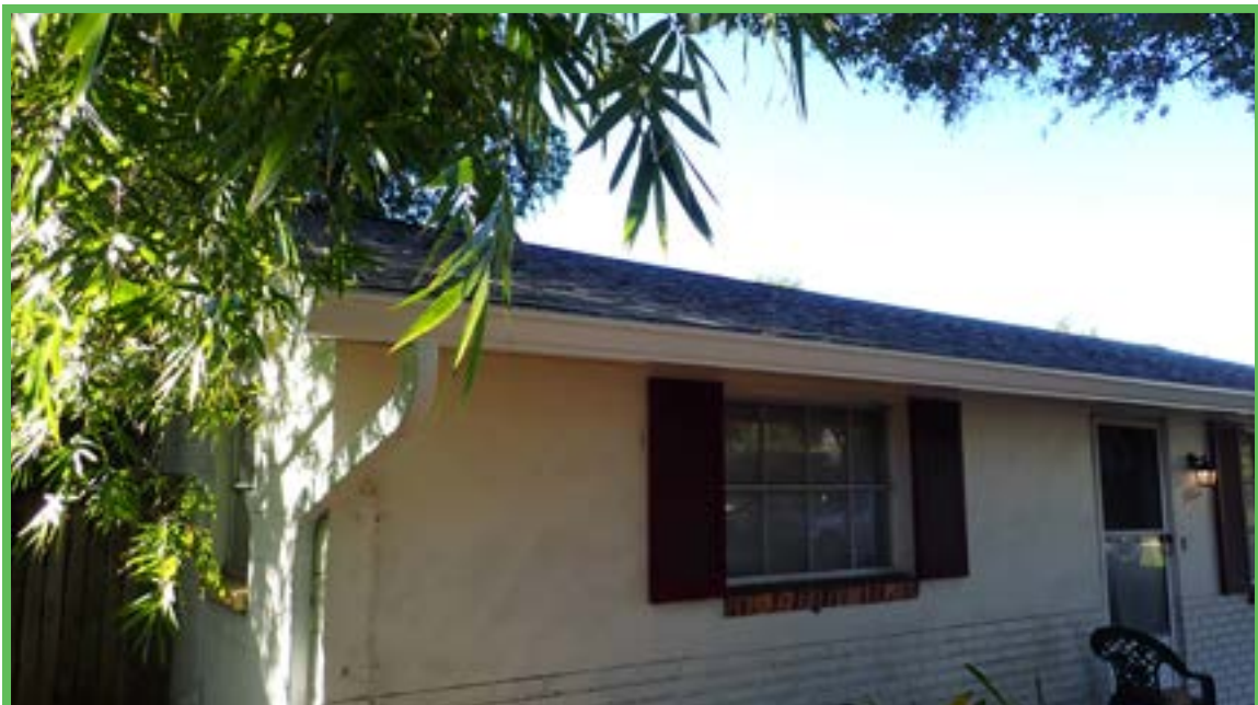
Front and Left Elevation