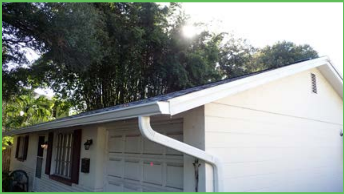
Front and Right Elevation

West Florida Inspections 2311 58th St E Palmetto Florida 34221 HI 3192