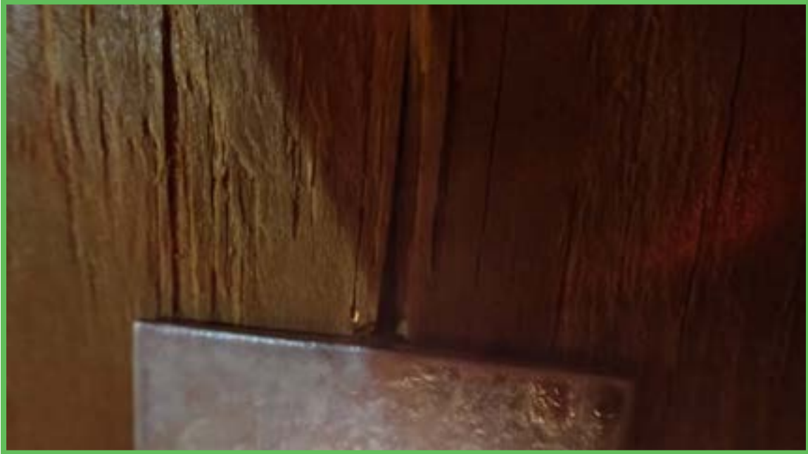
Secondary Water Resistance (SWR)

West Florida Inspections 2311 58th St E Palmetto Florida 34221 HI 3192