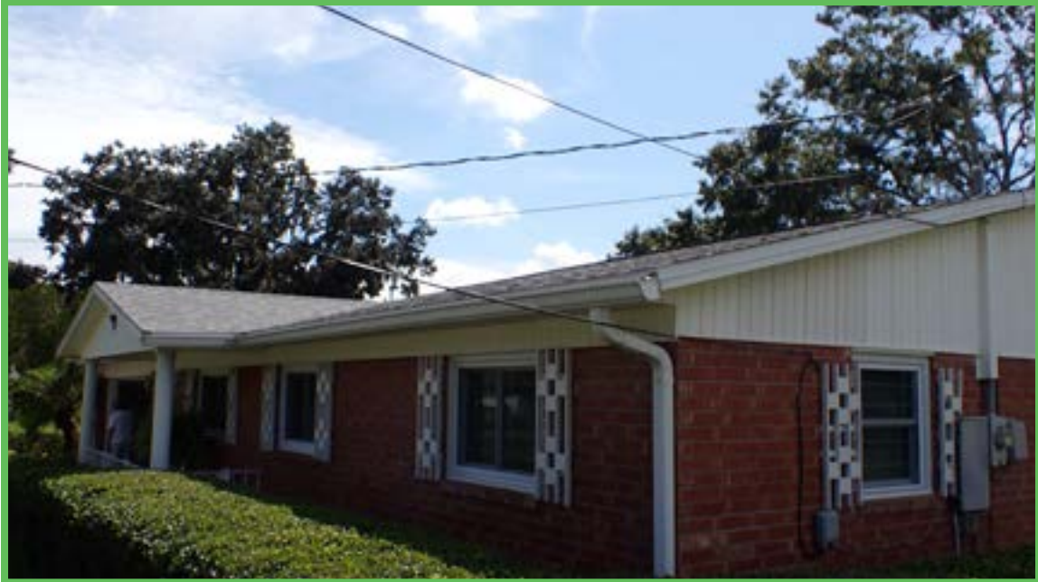
Front and Right Elevation

West Florida Inspections 2311 58th St E Palmetto Florida 34221 HI 3192