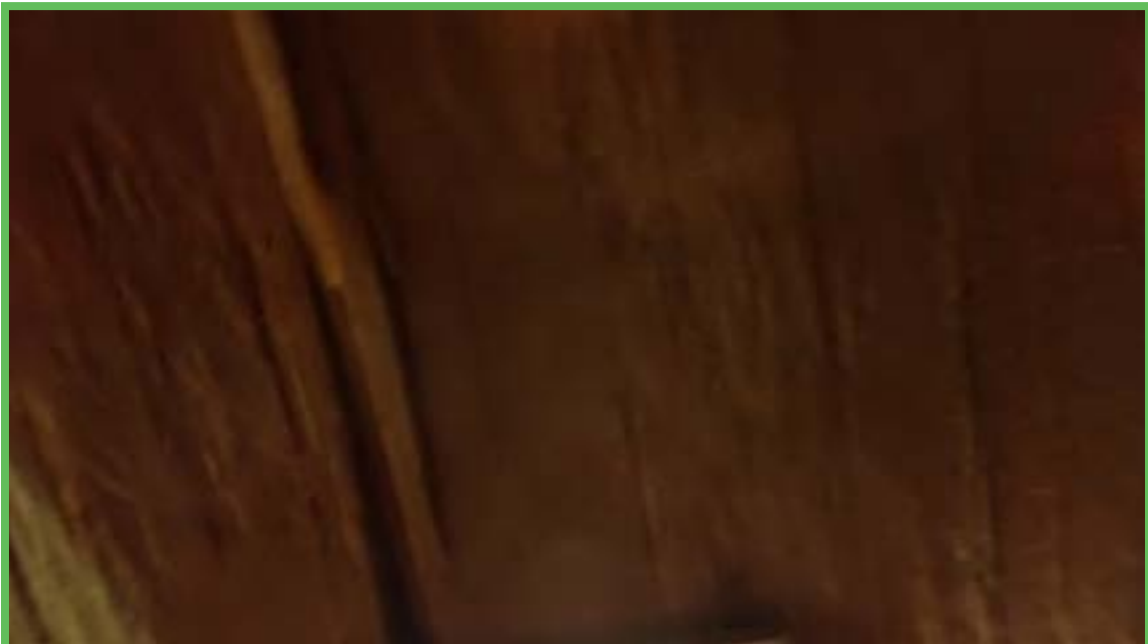
Secondary Water Resistance (SWR)