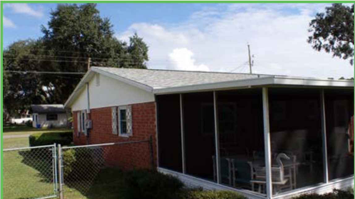
Rear and Right Elevation