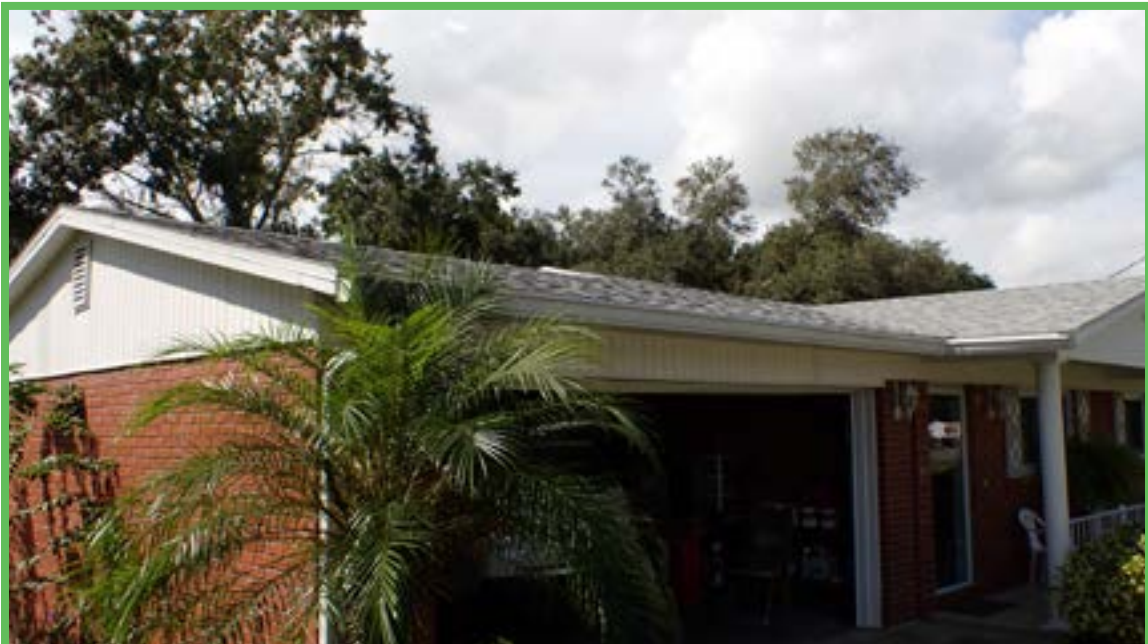
Front and Left Elevation