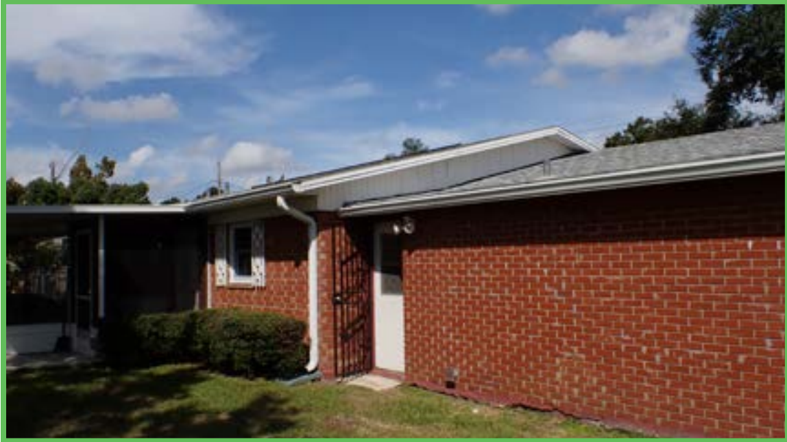
Rear and Left Elevation

West Florida Inspections 2311 58th St E Palmetto Florida 34221 HI 3192