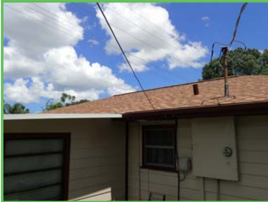
Rear and Left Elevation

West Florida Inspections 2311 58th St E Palmetto Florida 34221 HI 3192