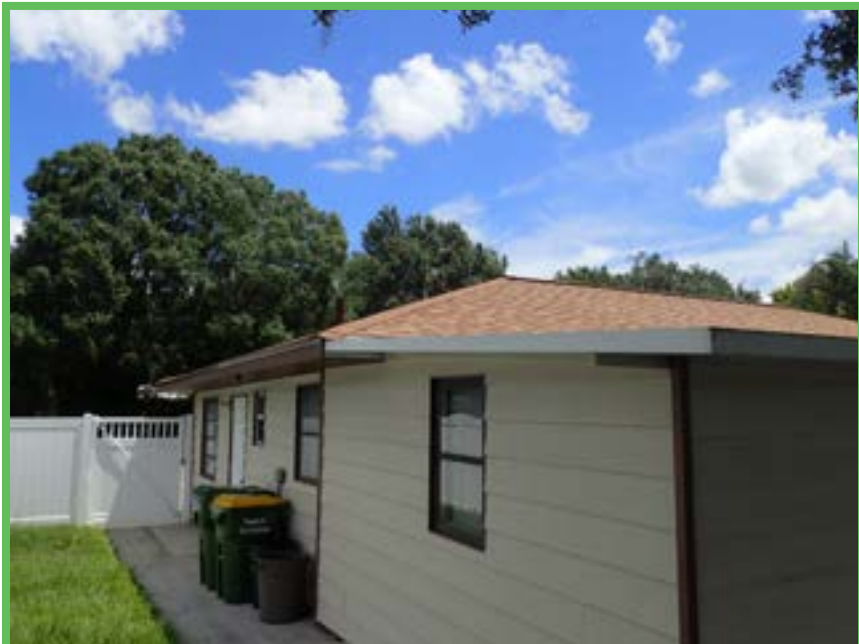
Rear and Right Elevation