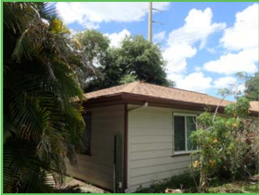
Front and Right Elevation

West Florida Inspections 2311 58th St E Palmetto Florida 34221 HI 3192