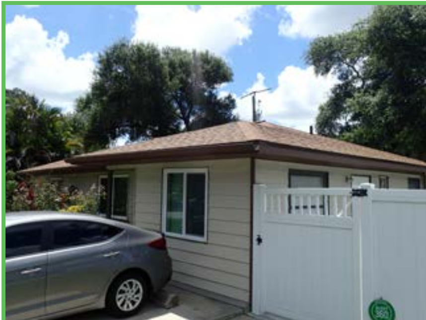
Front and Left Elevation