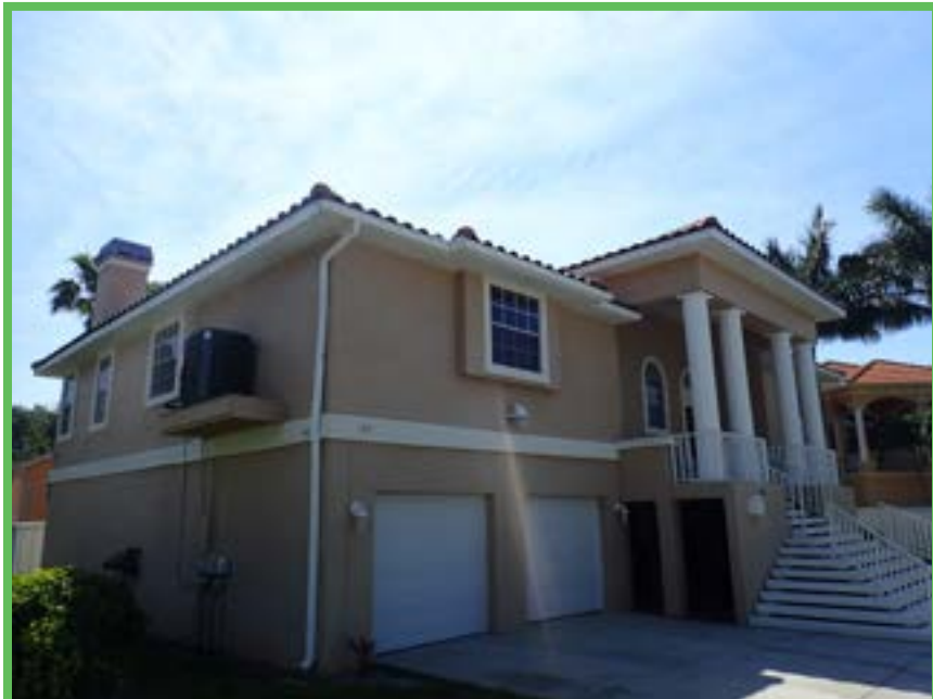
Front and Left Elevation