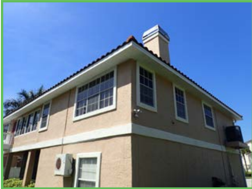
Rear and Left Elevation

West Florida Inspections 2311 58th St E Palmetto Florida 34221 HI 3192