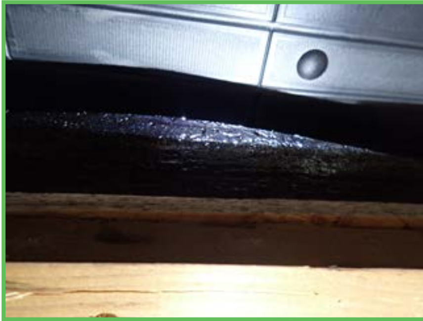
Secondary Water Resistance (SWR)

West Florida Inspections 2311 58th St E Palmetto Florida 34221 HI 3192