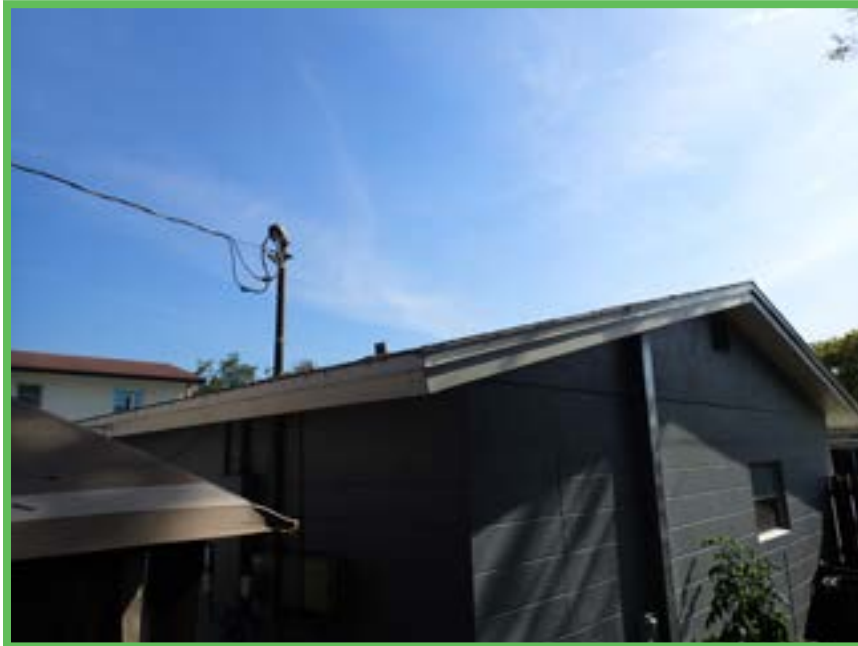
Rear and Left Elevation

West Florida Inspections 2311 58th St E Palmetto Florida 34221 HI 3192