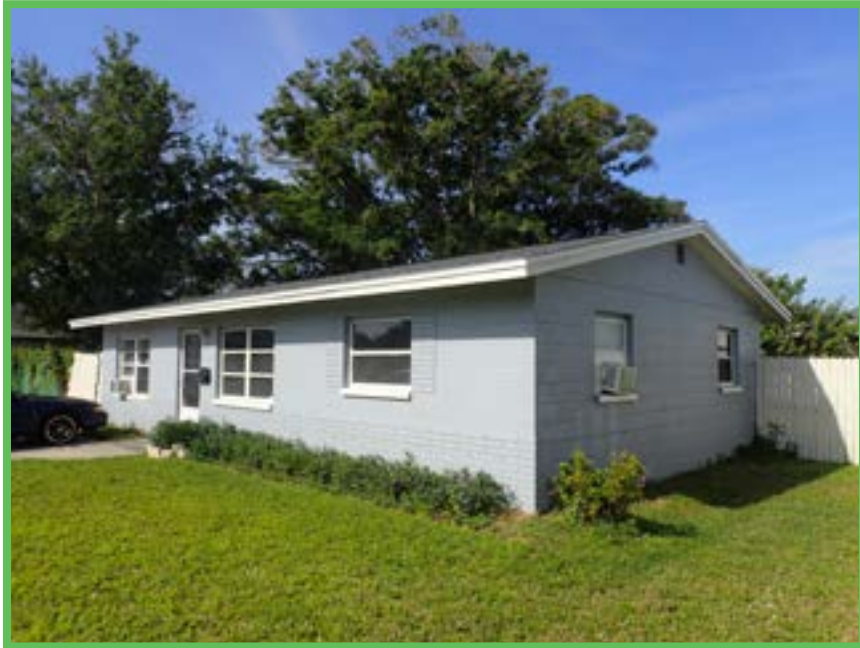
Front and Right Elevation

West Florida Inspections 2311 58th St E Palmetto Florida 34221 HI 3192