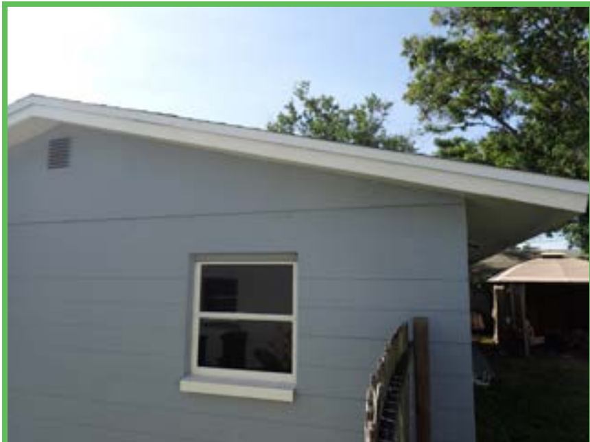
Rear and Right Elevation