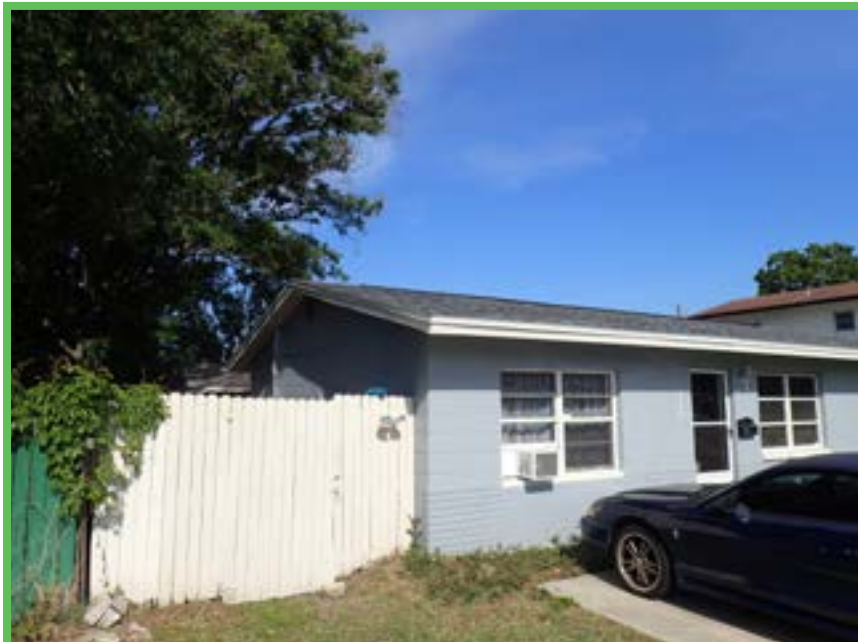
Front and Left Elevation