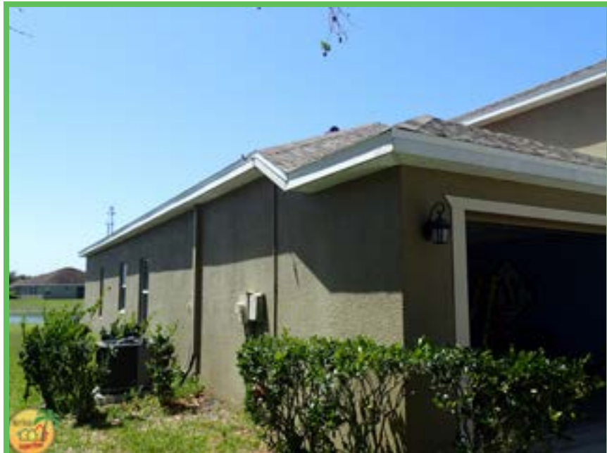
Front and Left Elevation