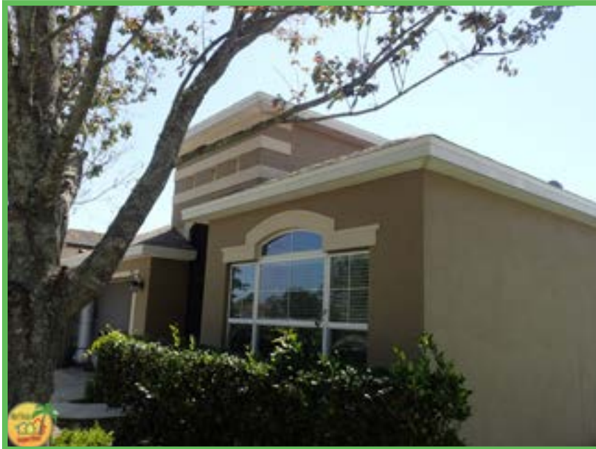
Front and Right Elevation

West Florida Inspections 2311 58th St E Palmetto Florida 34221 HI 3192