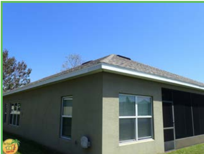
Rear and Right Elevation