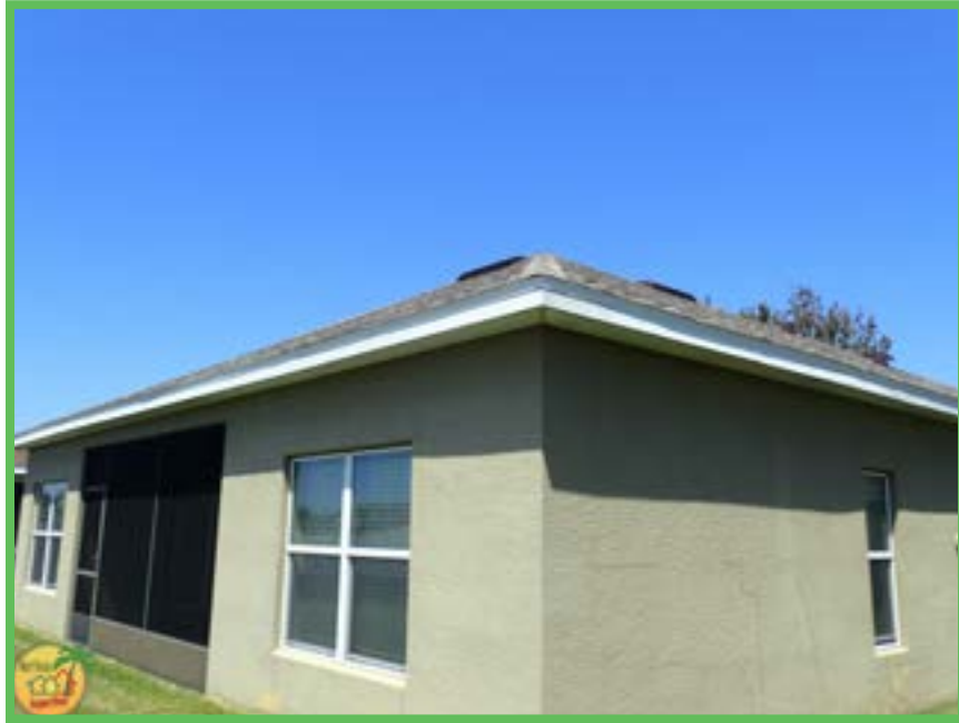
Rear and Left Elevation

West Florida Inspections 2311 58th St E Palmetto Florida 34221 HI 3192