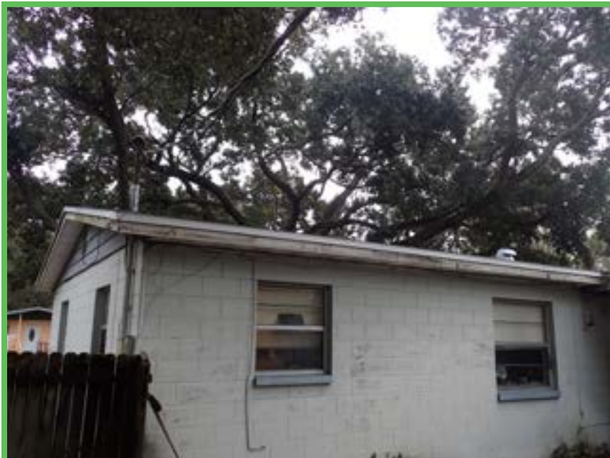
Rear and Right Elevation