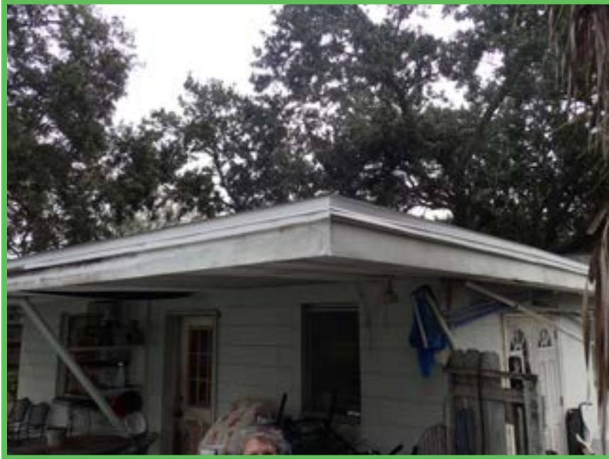
Rear and Left Elevation

West Florida Inspections 2311 58th St E Palmetto Florida 34221 HI 3192