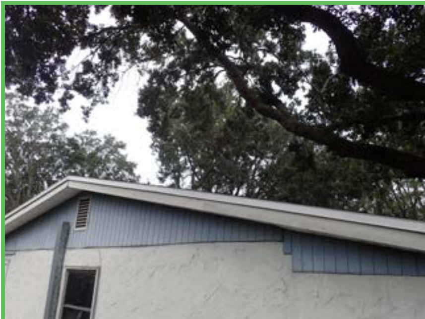
Front and Left Elevation