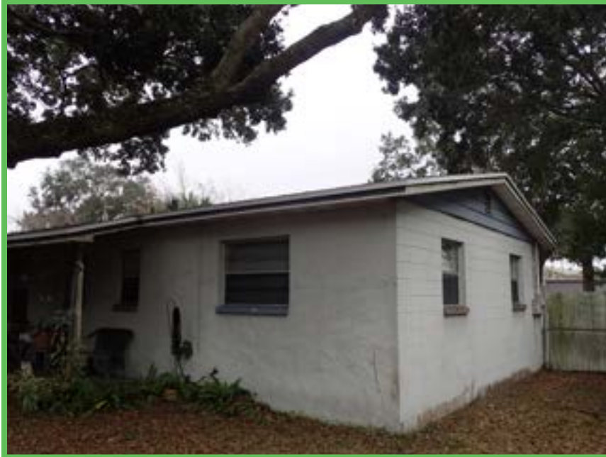
Front and Right Elevation

West Florida Inspections 2311 58th St E Palmetto Florida 34221 HI 3192