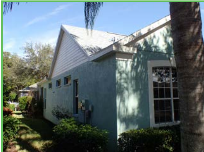
Rear and Right Elevation