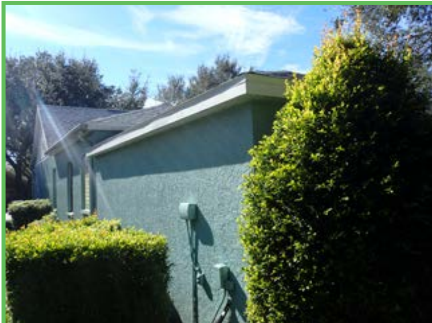
Front and Left Elevation