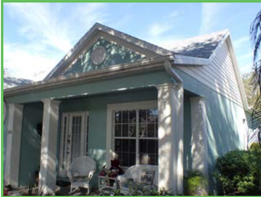
Rear and Left Elevation

West Florida Inspections 2311 58th St E Palmetto Florida 34221 HI 3192