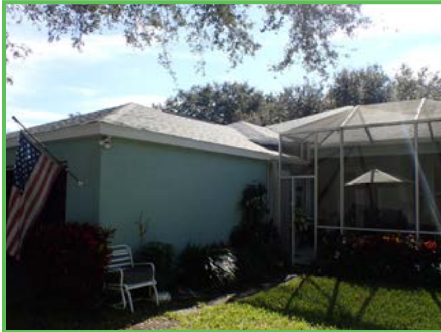
Front and Right Elevation

West Florida Inspections 2311 58th St E Palmetto Florida 34221 HI 3192