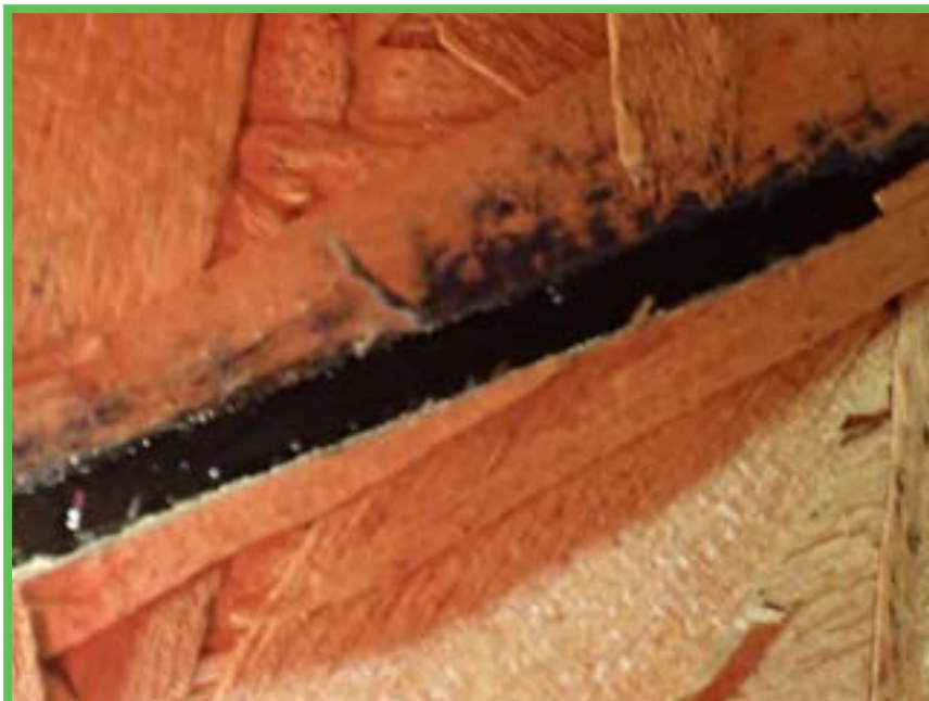
Secondary Water Resistance (SWR)