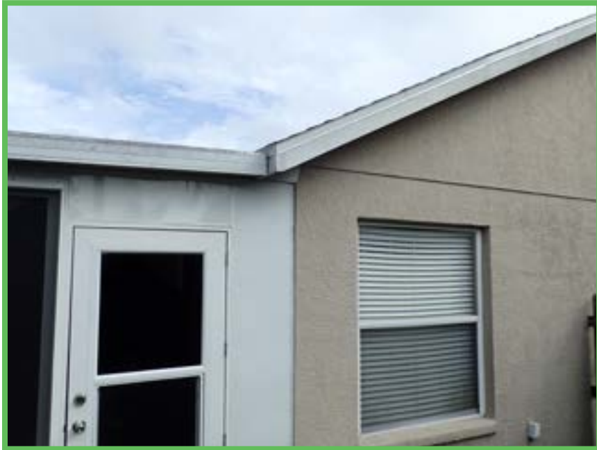
Rear and Left Elevation

West Florida Inspections 2311 58th St E Palmetto Florida 34221 HI 3192