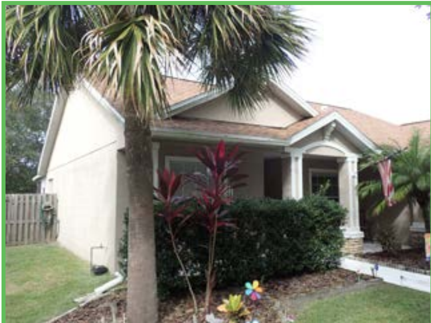
Front and Left Elevation