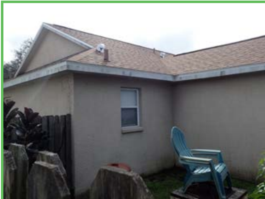
Rear and Right Elevation