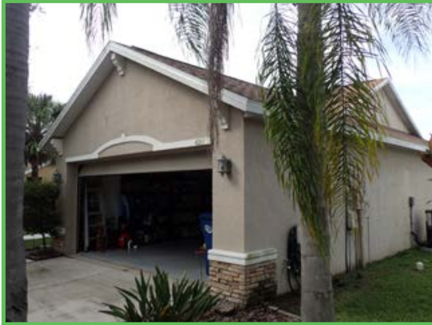
Front and Right Elevation

West Florida Inspections 2311 58th St E Palmetto Florida 34221 HI 3192