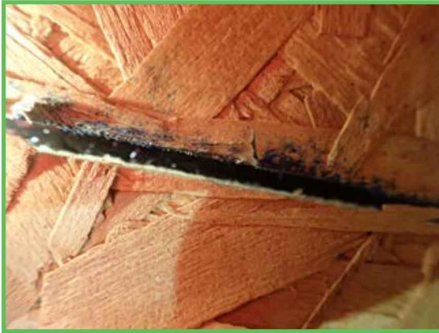
Secondary Water Resistance (SWR)

West Florida Inspections 2311 58th St E Palmetto Florida 34221 HI 3192