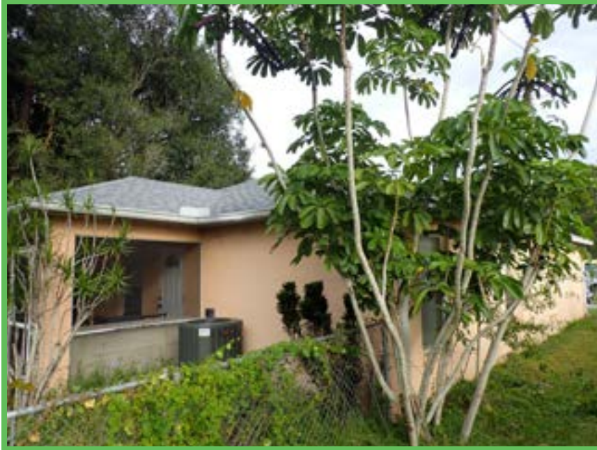
Rear and Left Elevation

West Florida Inspections 2311 58th St E Palmetto Florida 34221 HI 3192