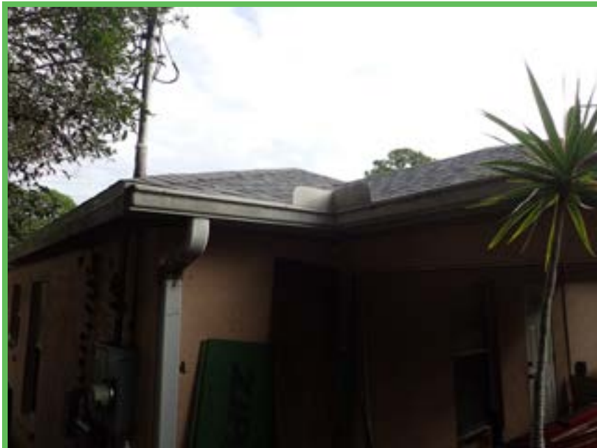
Rear and Right Elevation