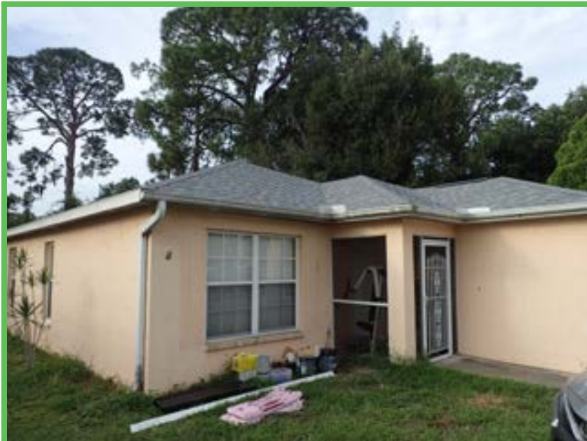
Front and Left Elevation