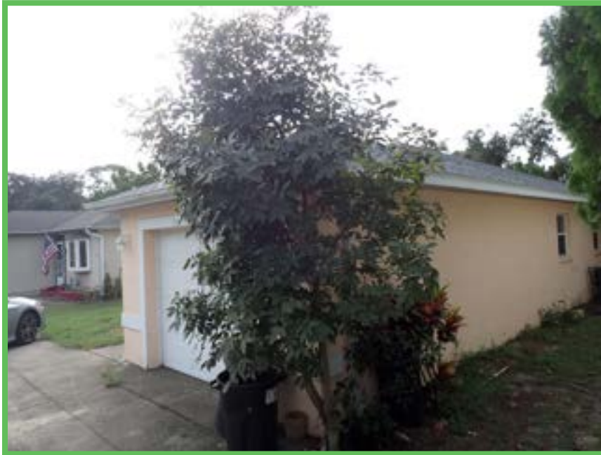
Front and Right Elevation

West Florida Inspections 2311 58th St E Palmetto Florida 34221 HI 3192