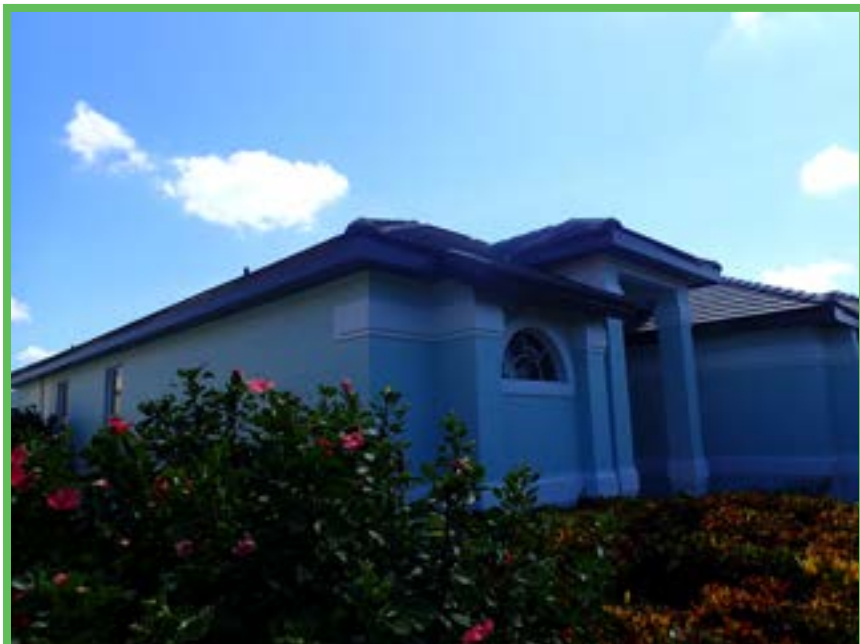
Front and Left Elevation