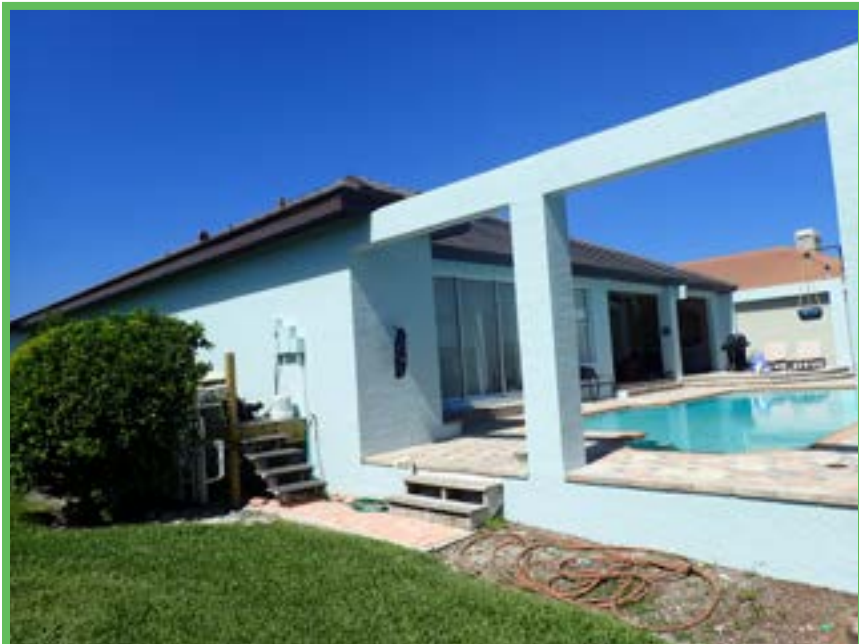
Rear and Right Elevation