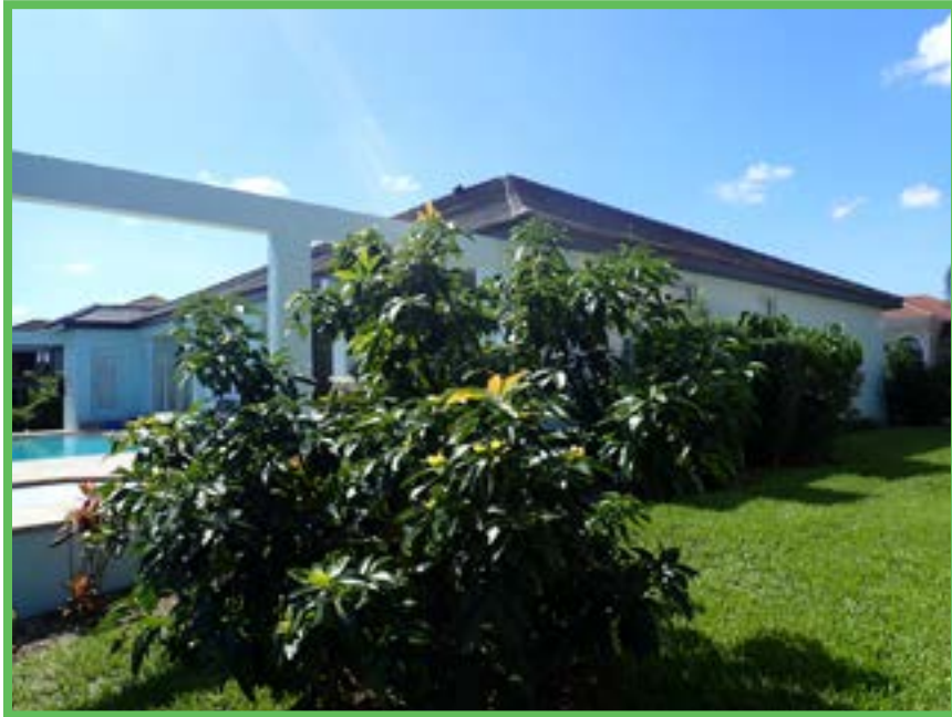
Rear and Left Elevation

West Florida Inspections 2311 58th St E Palmetto Florida 34221 HI 3192