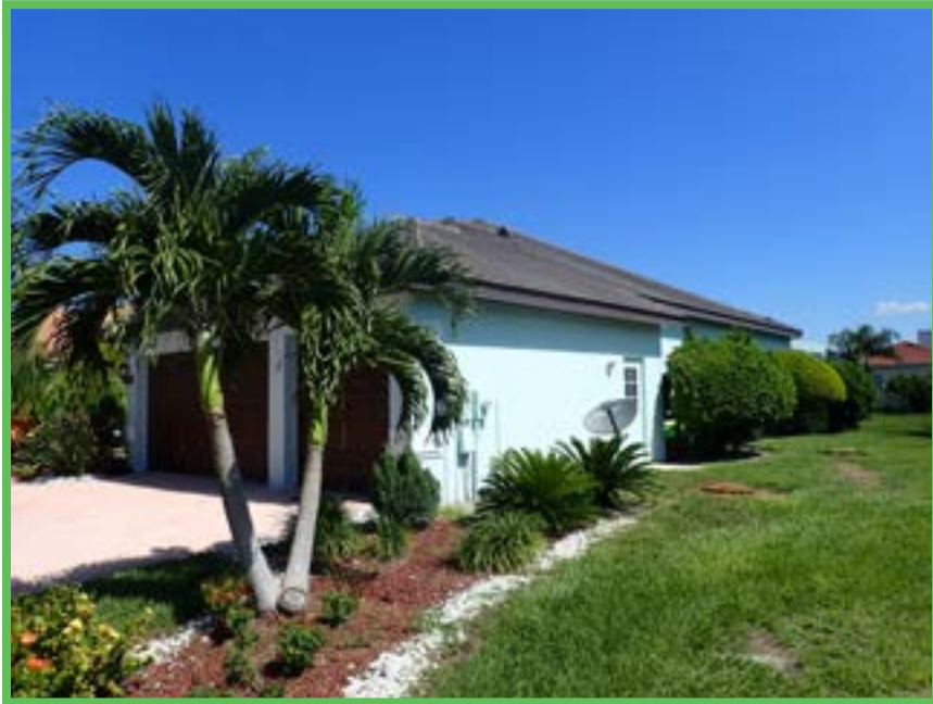
Front and Right Elevation

West Florida Inspections 2311 58th St E Palmetto Florida 34221 HI 3192